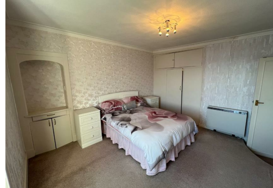
Bedroom 2 11'3" x 10'6" (3.43 x 3.21)