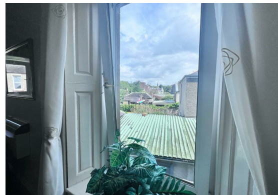
BEDROOM 11'7" x 9'6" (3.53m x 2.90m) GARDEN & OUTBUILDINGS