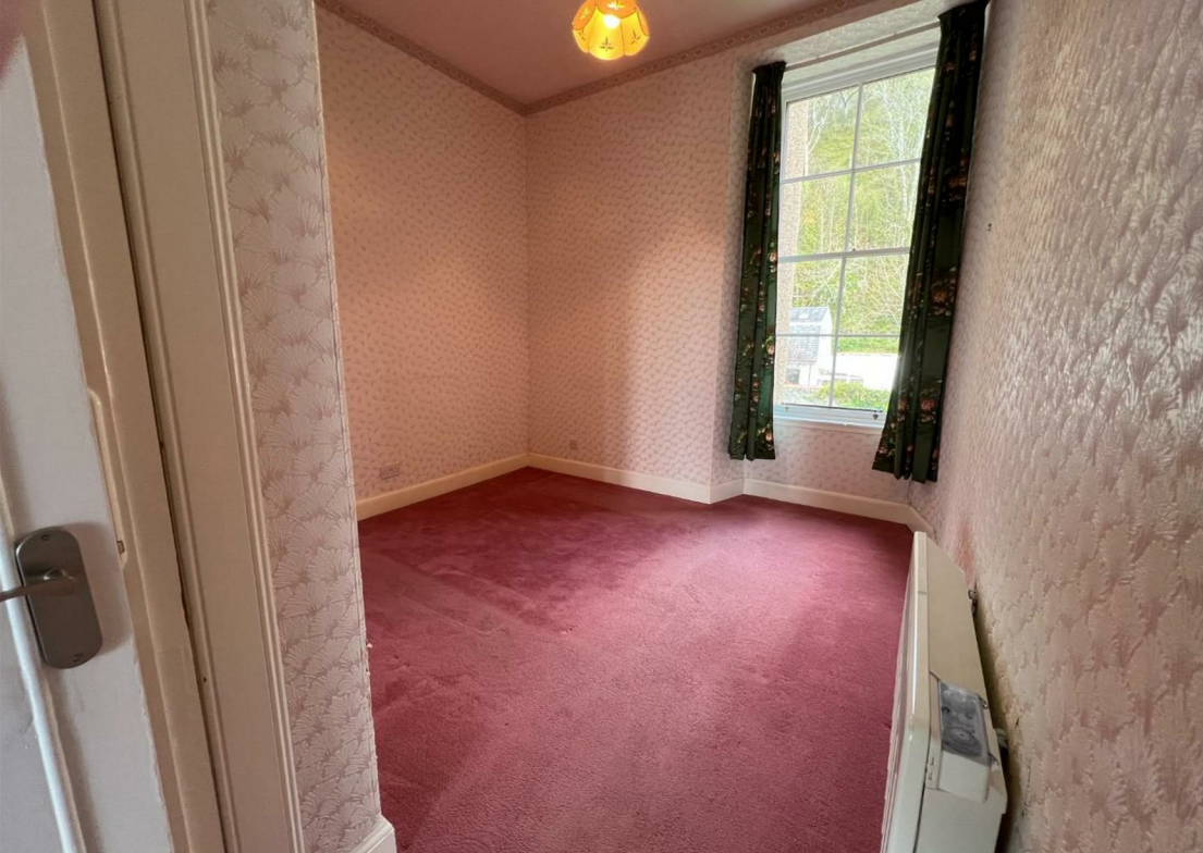
Bedroom 2 13'9" x 10'8" (4.19m x 3.25m)