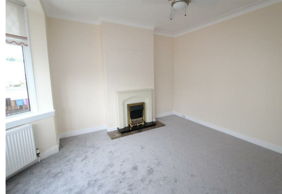
Bedroom 1 14'8 x 12'9 (4.47m x 3.89m)