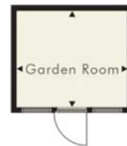
Garden rooms by Bakers of Haywards Heath