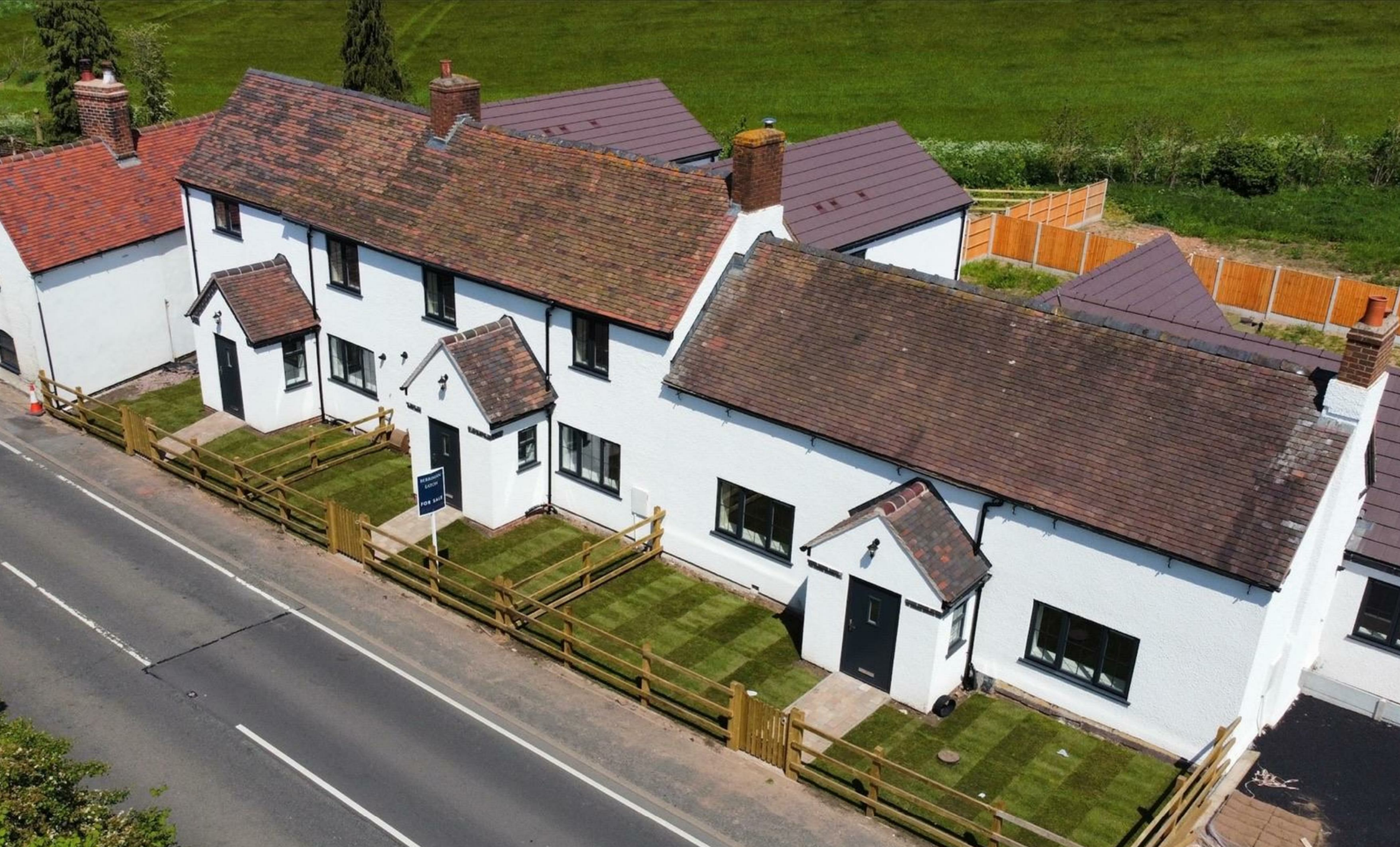
1 Ackleton Meadows, Stableford, Bridgnorth, Shropshire, WV15 5LR