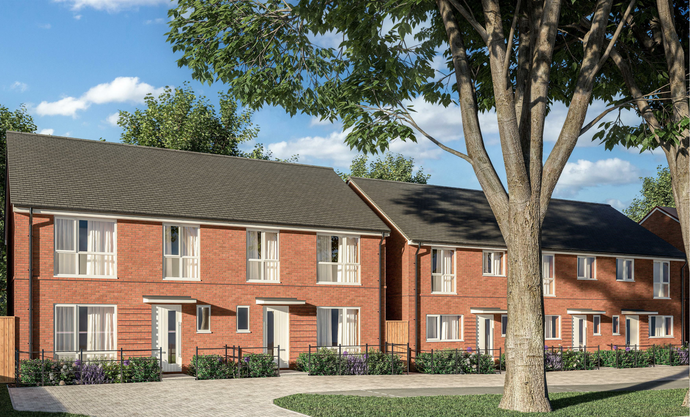
Plot 2, Nightingale Place Vicarage Road, Wolverhampton, WV2 1DT