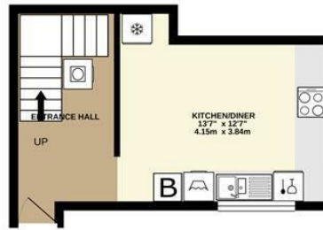
1ST FLOOR 263 sq.ft. (24.4 sq.m.) approx.

GROUND FLOOR 238 sq.ft. (22.1 sq.m.) approx.