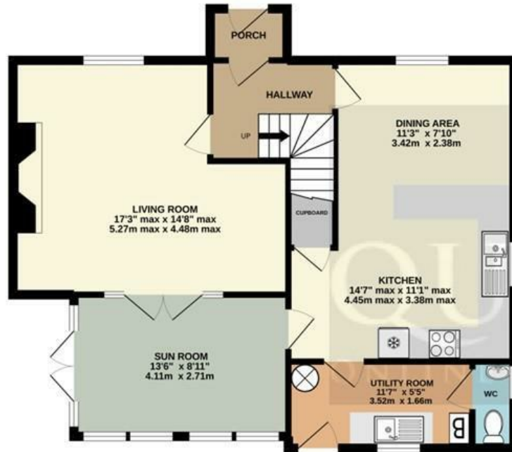
1ST FLOOR 588 sq.ft. (54.7 sq.m.) approx.