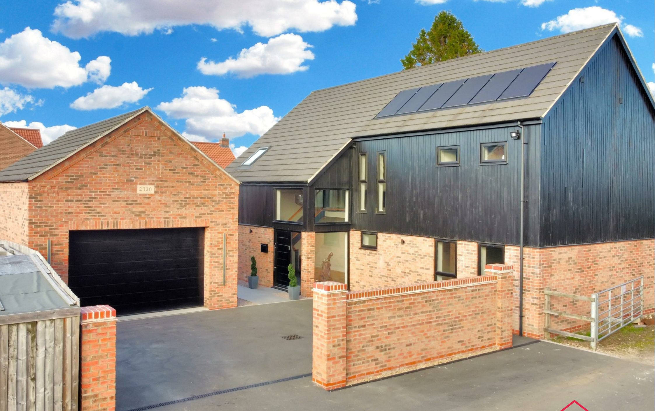
The Granary Barn, High Street, Collingham, Newark