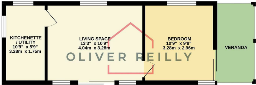
Annexe Floor Plan