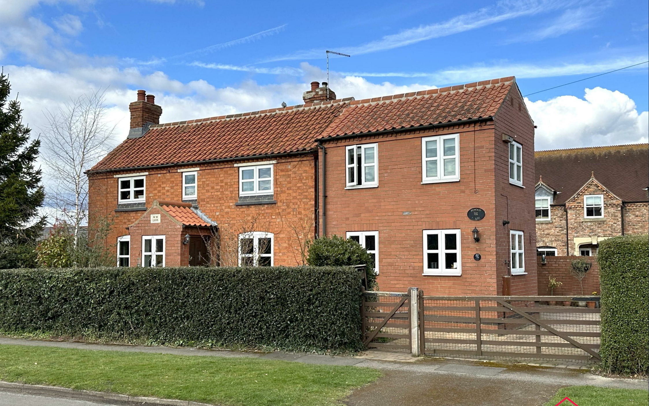
Penquit House, Woodhill Road, Collingham, Newark