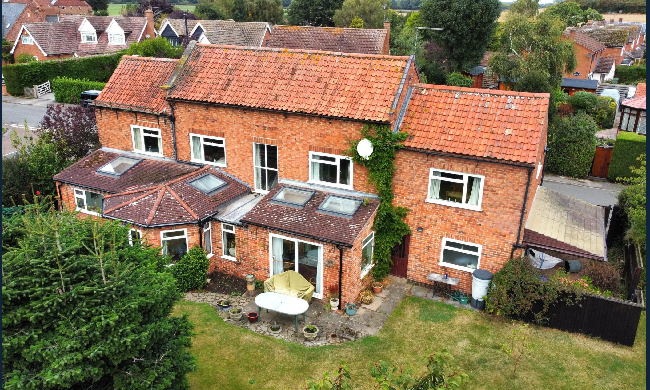
Woodhill Farmhouse, Woodhill Road, Collingham