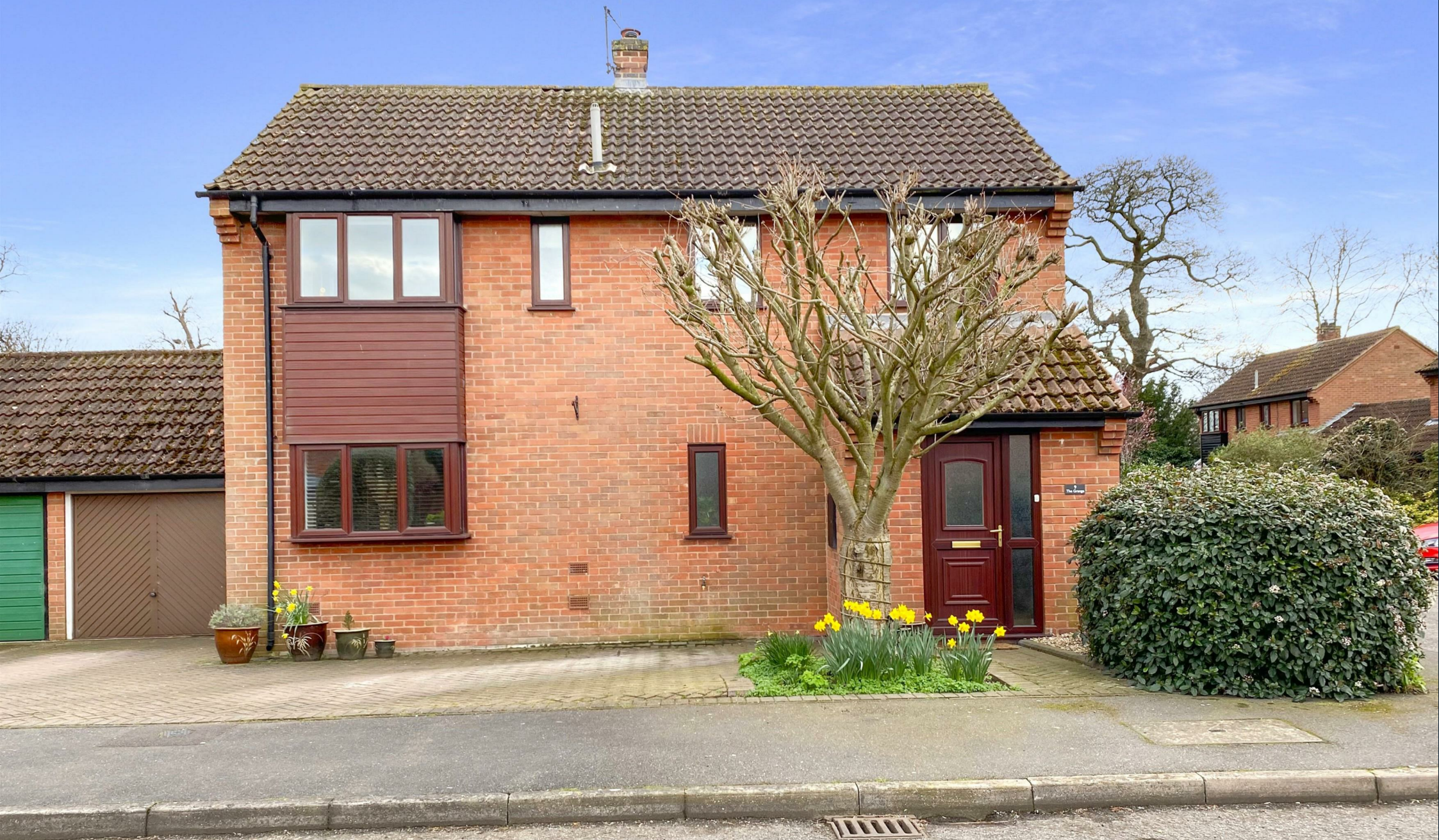
The Grange, North Muskham, Newark