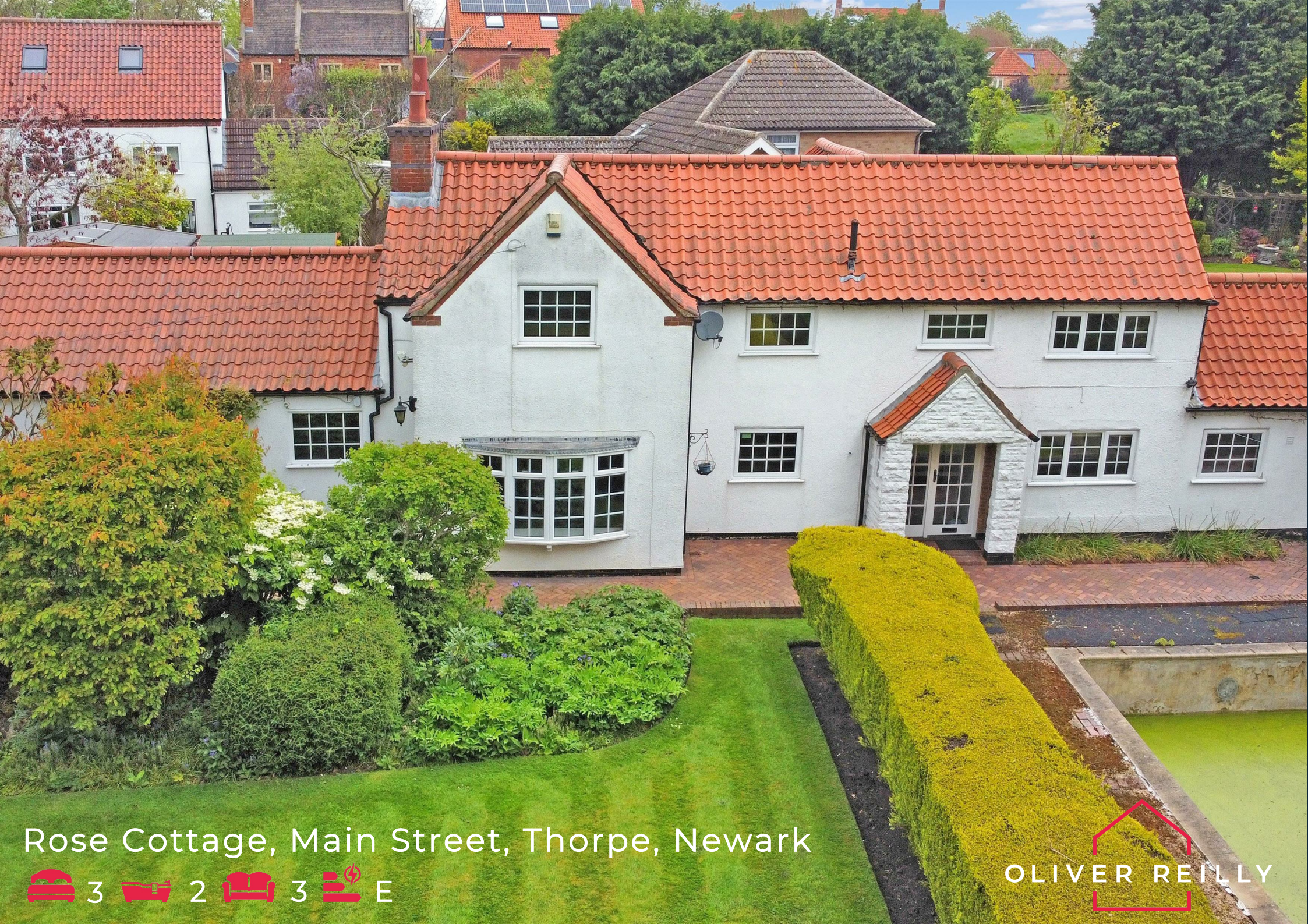
Rose Cottage, Main Street, Thorpe, Newark