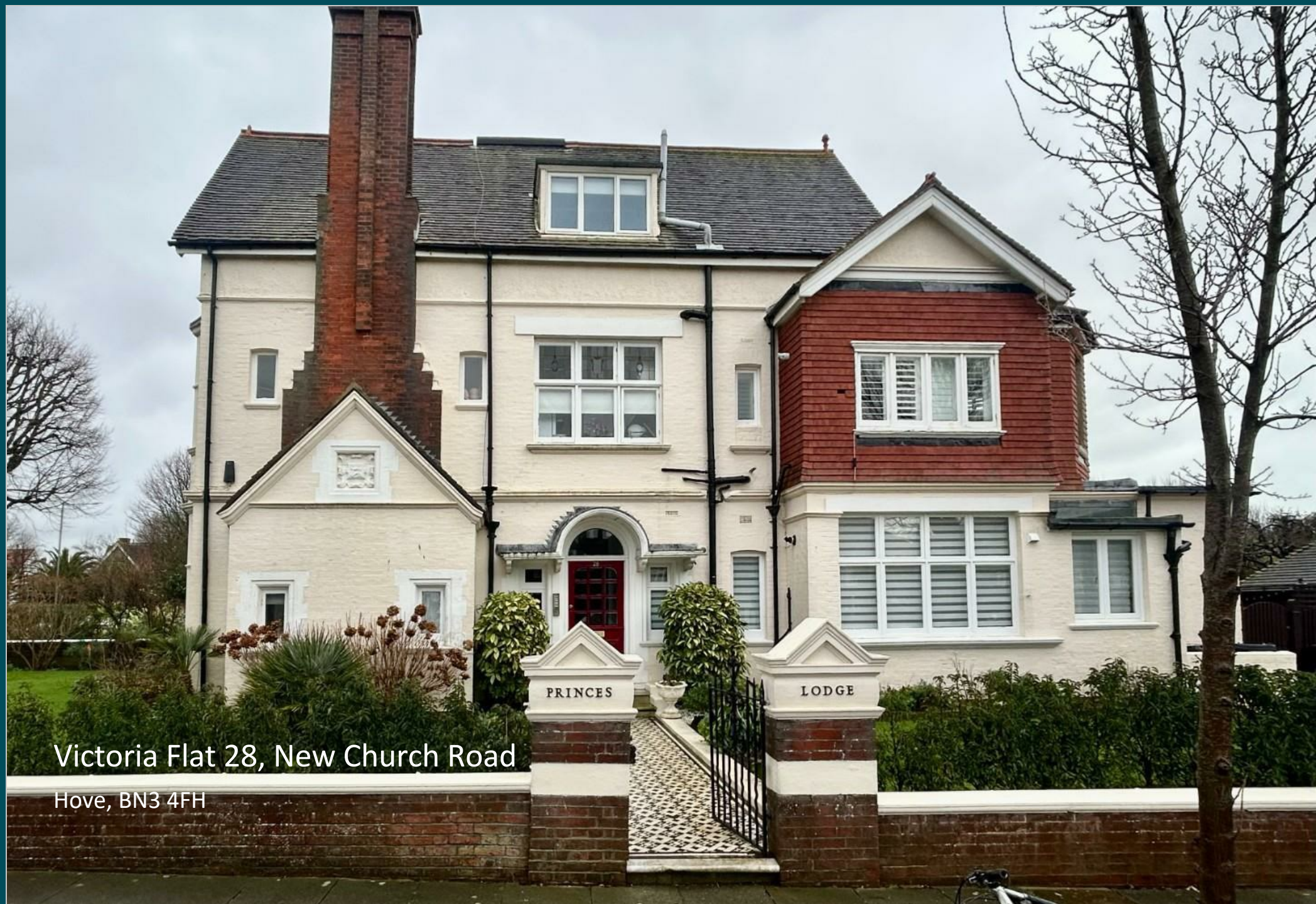
Victoria Flat 28, New Church Road Hove, BN3 4FH