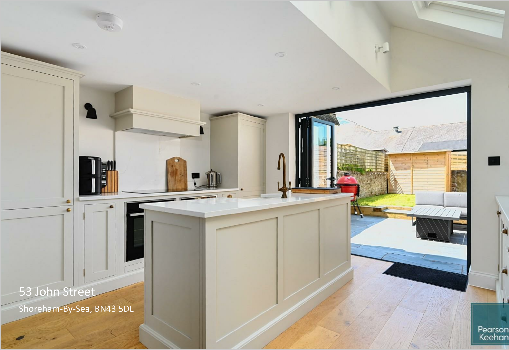
53 John Street Shoreham-By-Sea, BN43 5DL