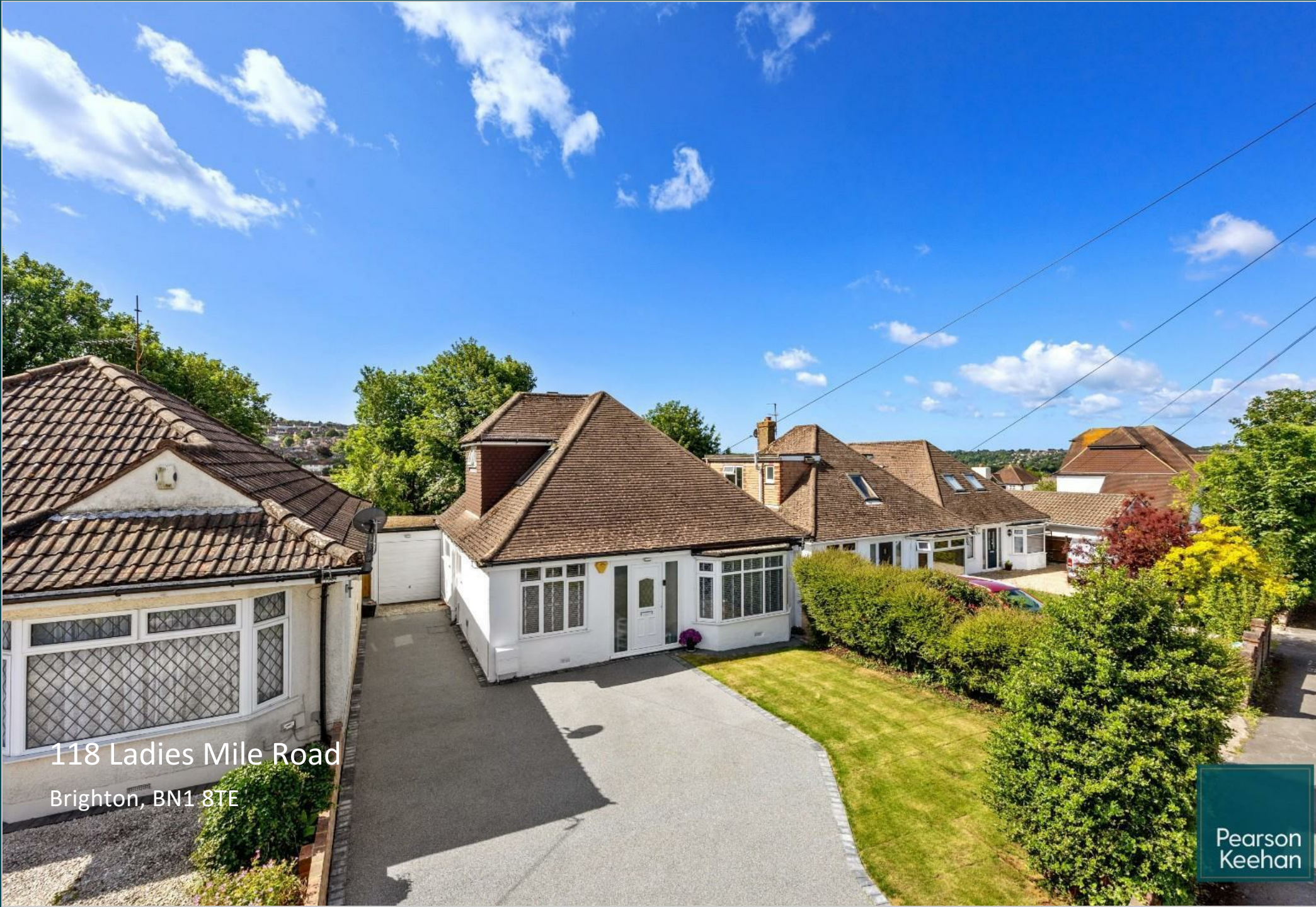
118 Ladies Mile Road Brighton, BN1 8TE