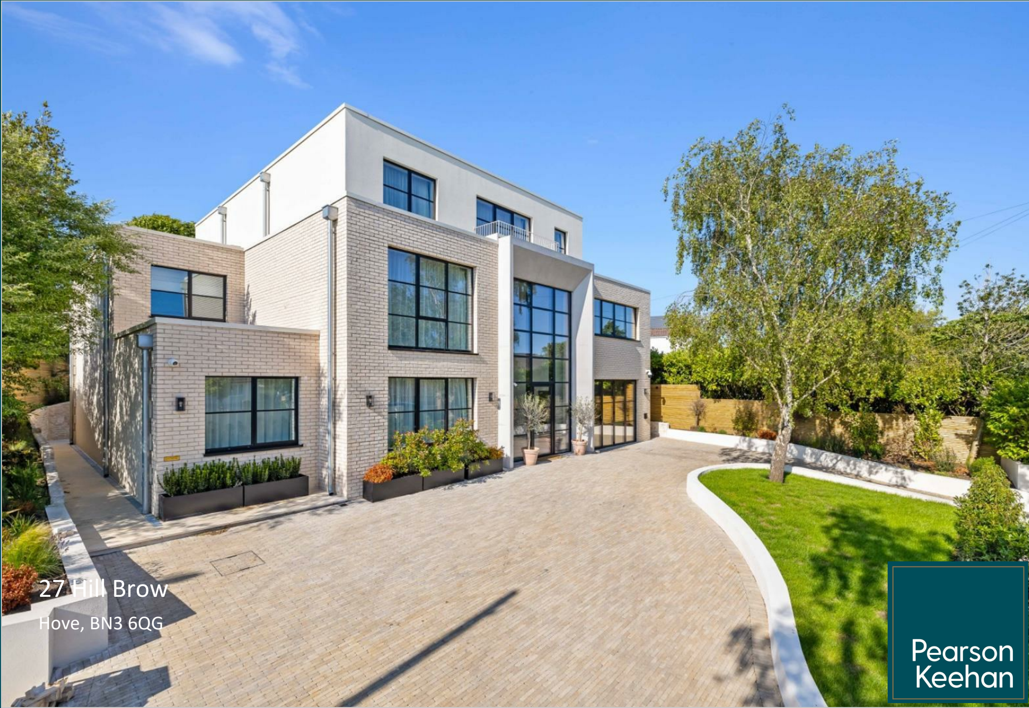
27 Hill Brow Hove, BN3 6QG