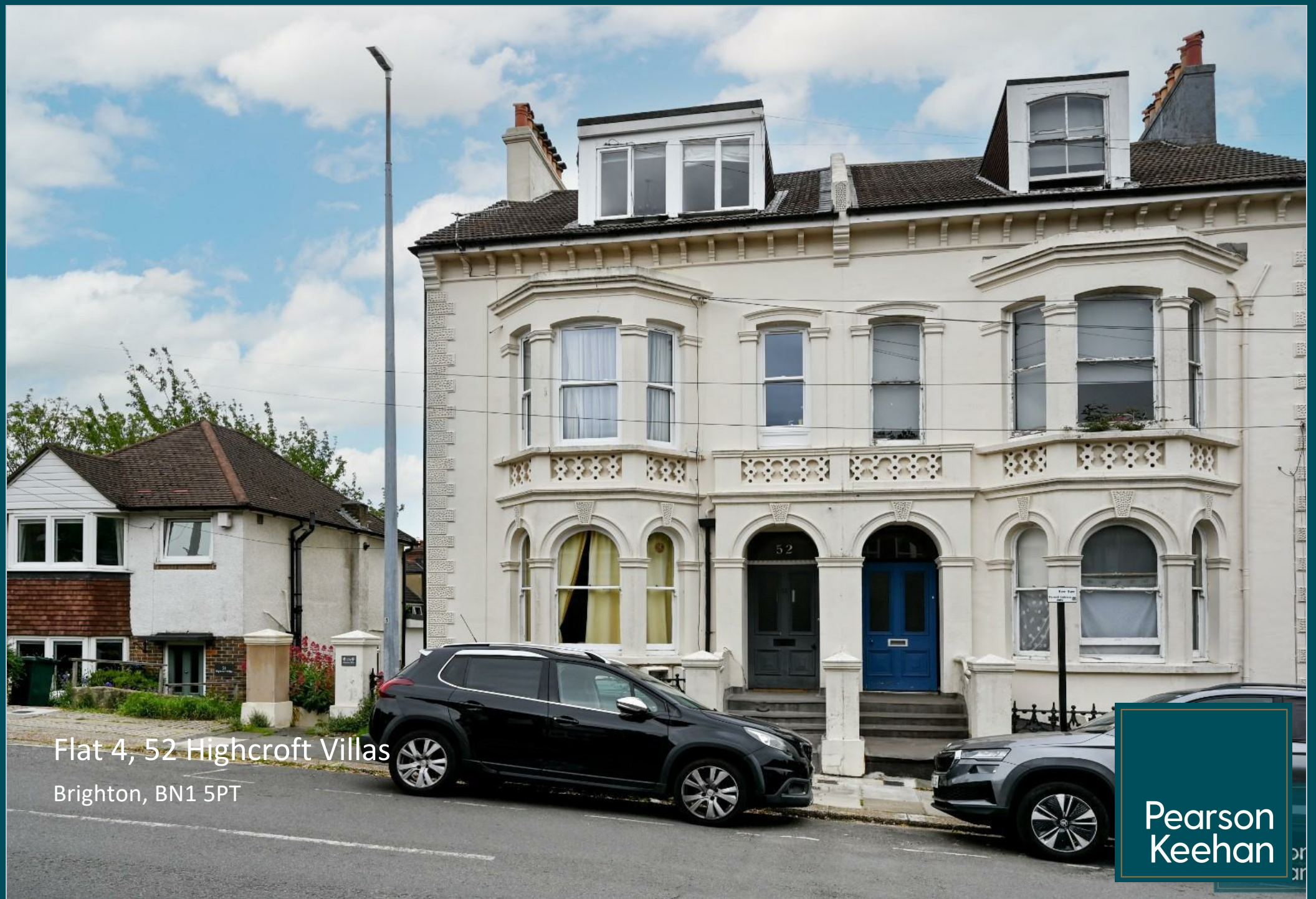
Flat 4, 52 Highcroft Villas Brighton, BN1 5PT