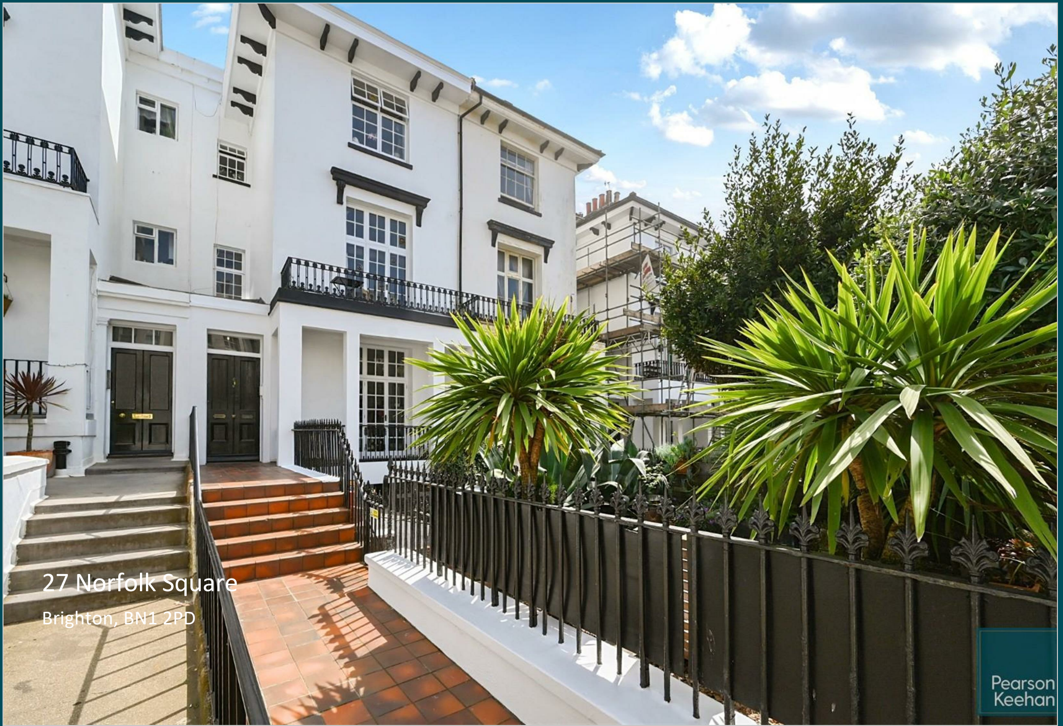
27 Norfolk Square Brighton, BN1 2PD