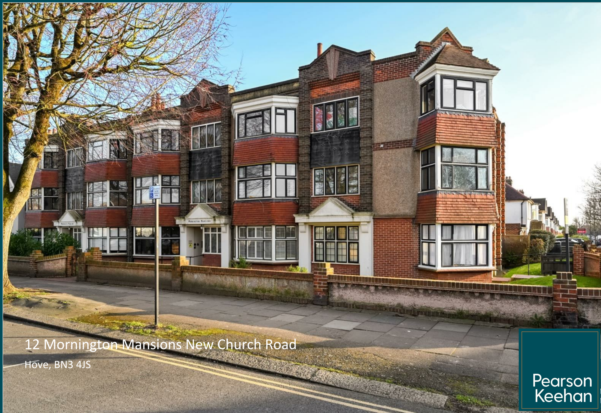
12 Mornington Mansions New Church Road Hove, BN3 4JS