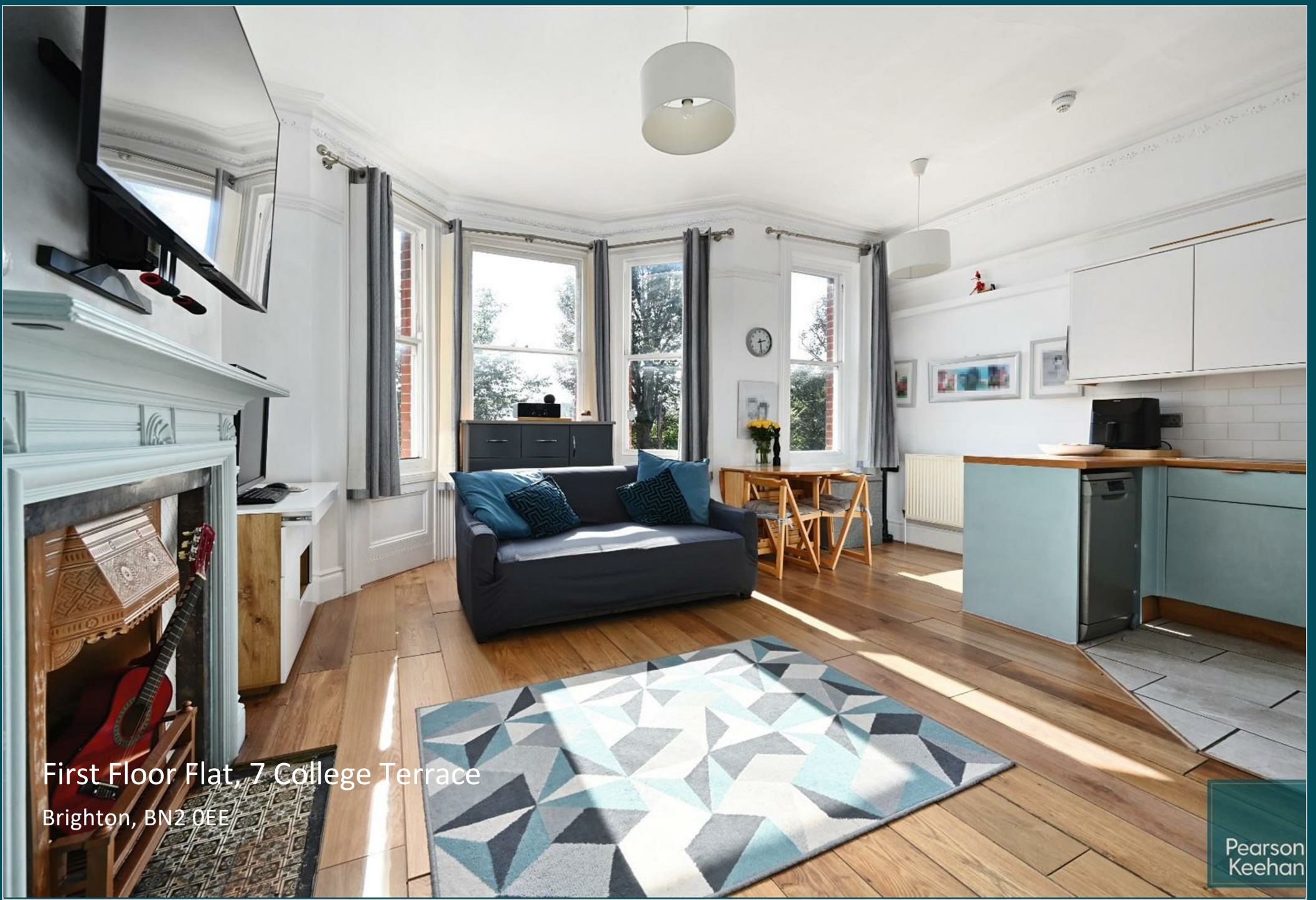
First Floor Flat, 7 College Terrace Brighton, BN2 0EE