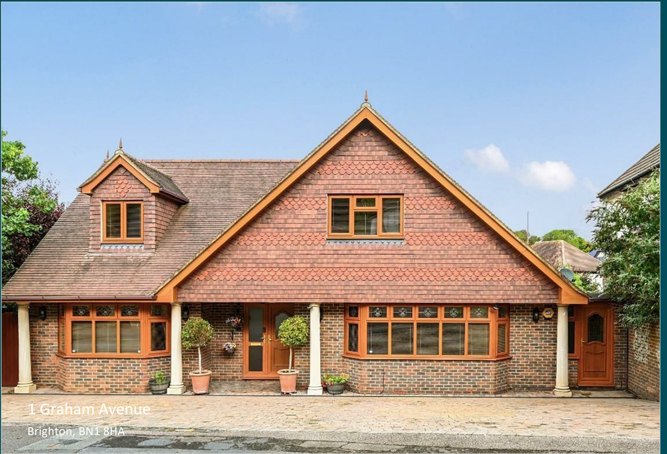
1 Graham Avenue Brighton, BN1 8HA