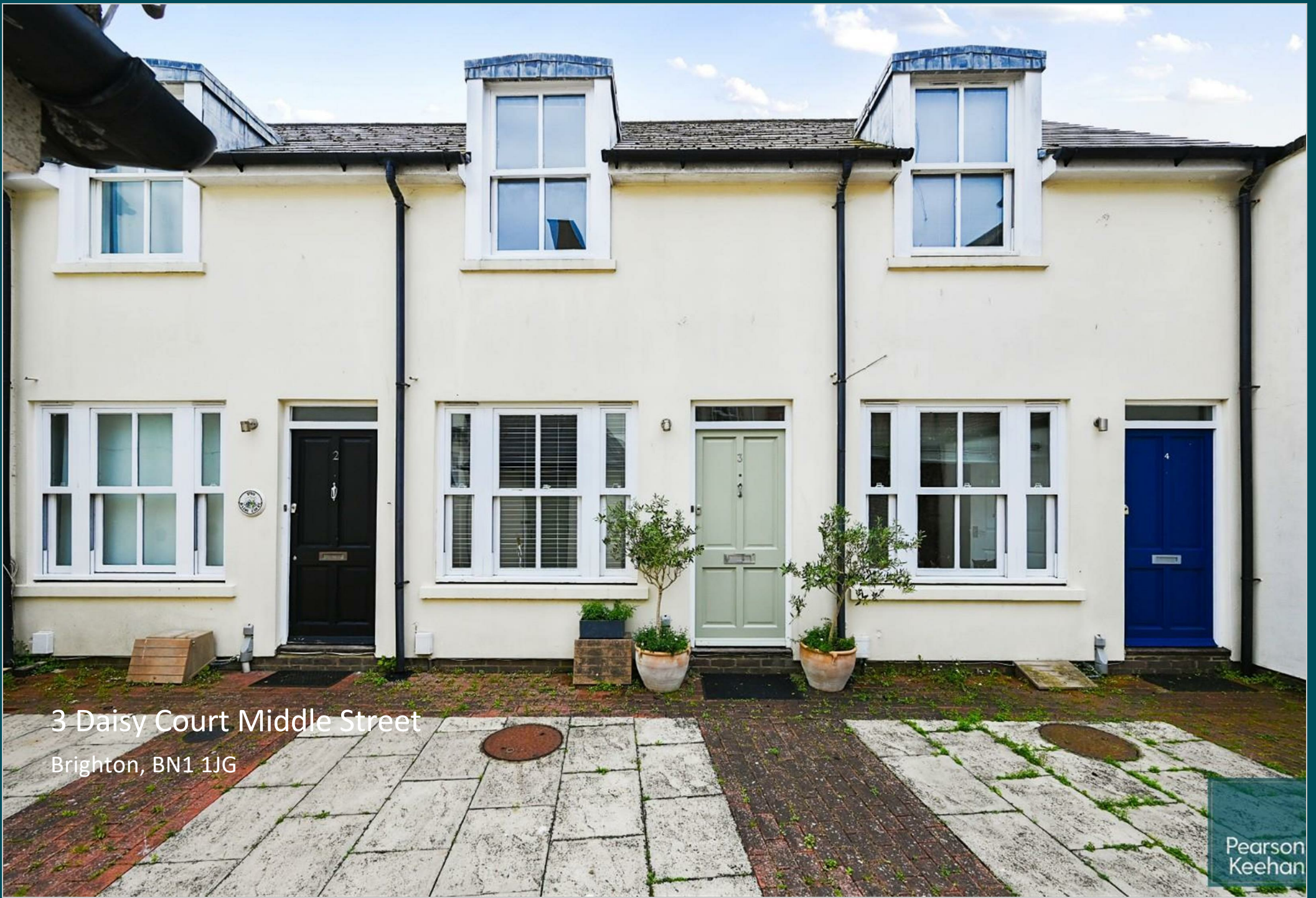
3 Daisy Court Middle Street Brighton, BN1 1JG