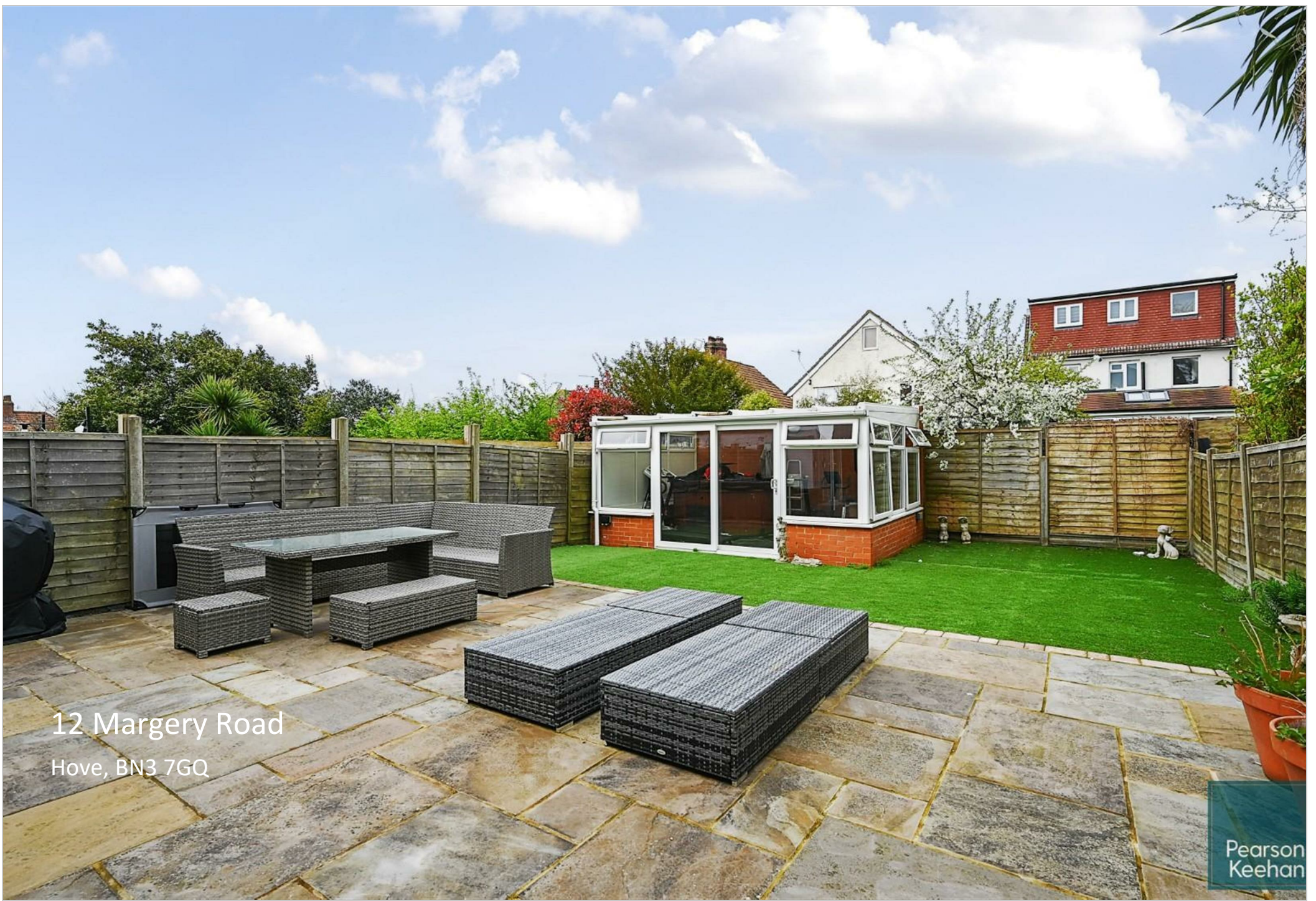
12 Margery Road Hove, BN3 7GQ