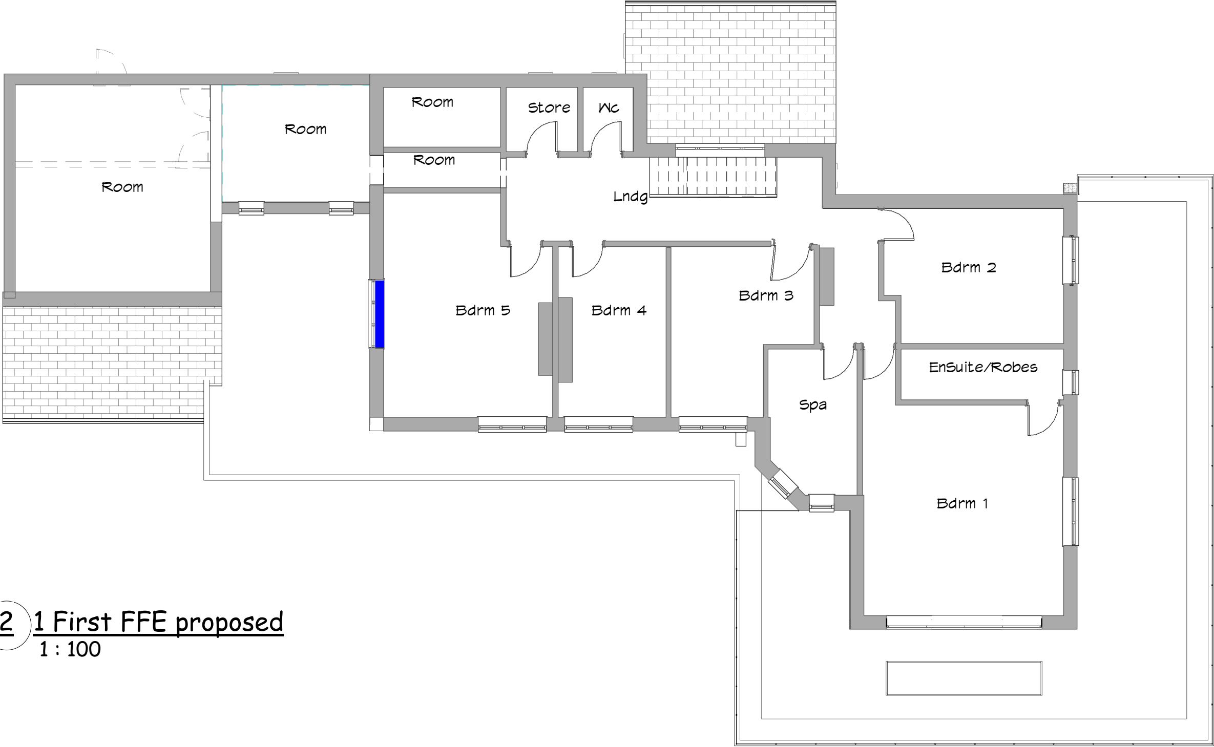
2 1 First FFE proposed 1 : 100

These are Planning drawings and should not be used for construction. Any structural elements are illustrative and dimensions are estimates - no calculations have been completed or specification completed for building regulations. Openings and headroom shown are indicative and may be affected once steelwork calculations have been completed. Final dimensions will depend on actual wall thicknesses used in construction and may vary where taken in association with existing walls.