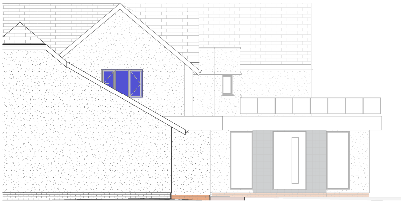
3 LHS Proposed 1 : 100