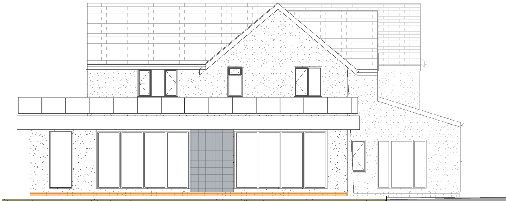
1 RHS Proposed 1 : 100

These are Planning drawings and should not be used for construction. Any structural elements are illustrative and dimensions are estimates - no calculations have been completed or specification completed for building regulations. Openings and headroom shown are indicative and may be affected once steelwork calculations have been completed. Final dimensions will depend on actual wall thicknesses used in construction and may vary where taken in association with existing walls.