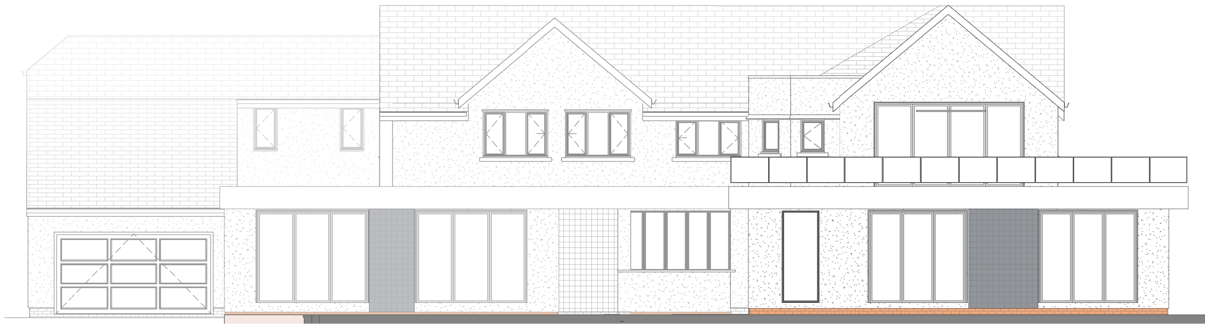
2 Front Proposed 1 : 100