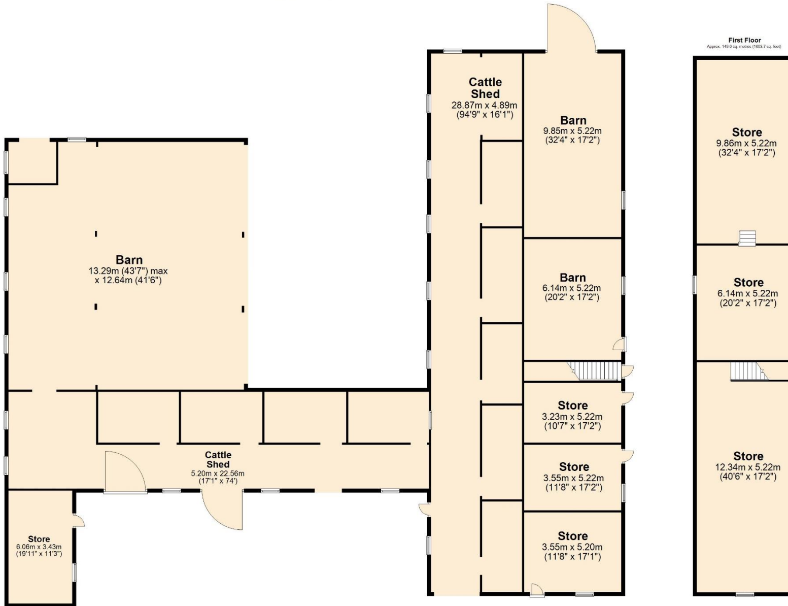
First Floor Approx. 149.0 sq. metres (1603.7 sq. feet)