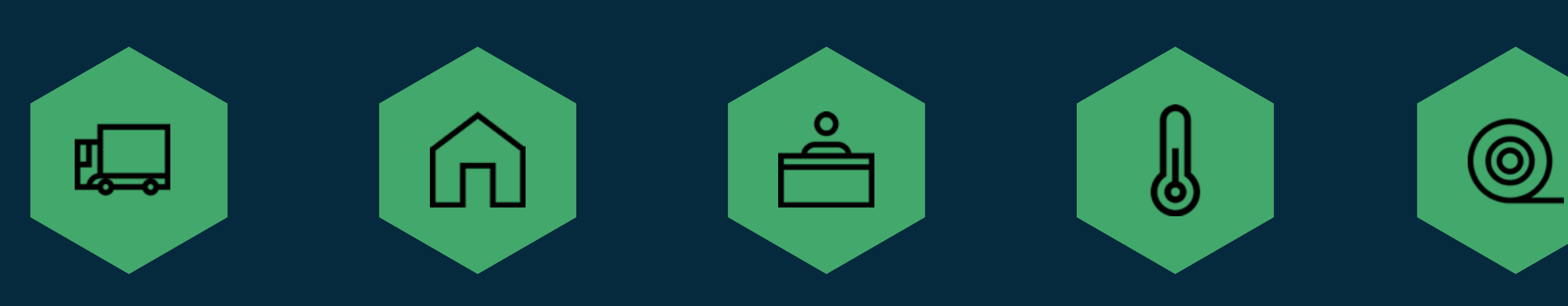
Up to 50 KN/m2 floor loading