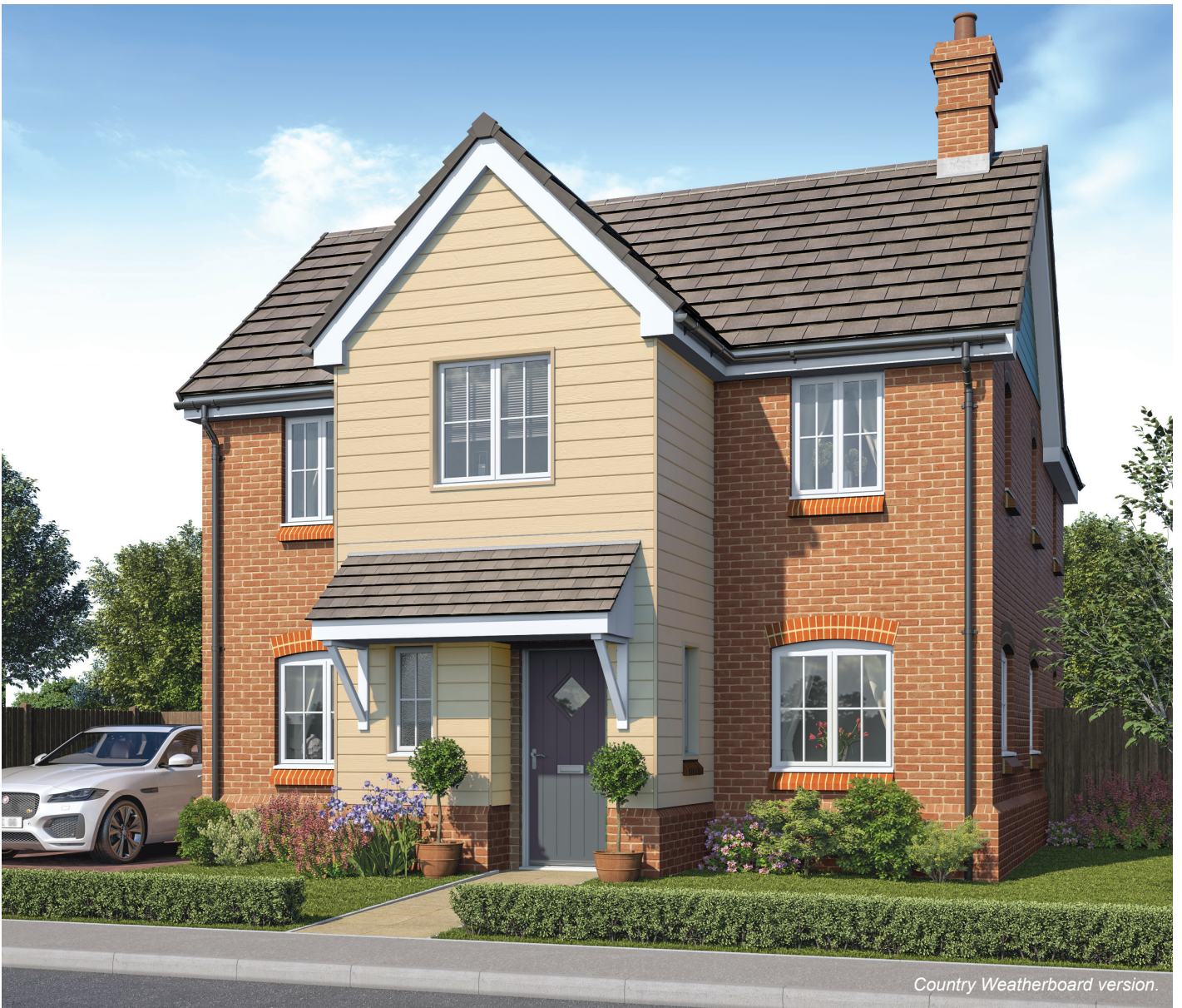
Country Weatherboard version.