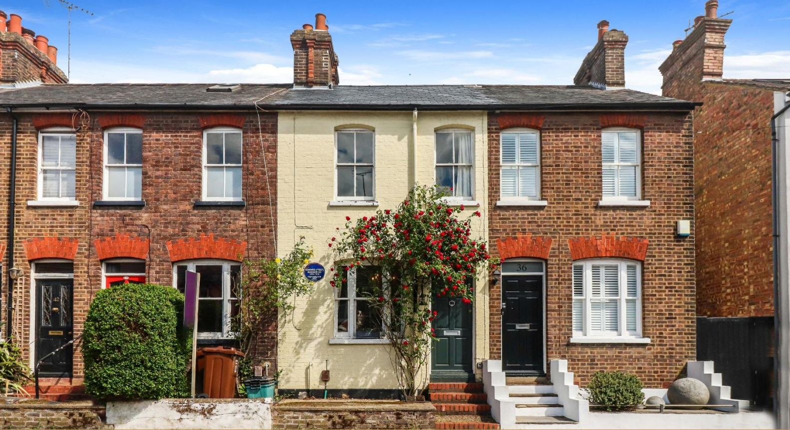
Cannon Street, St Albans