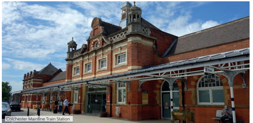
Colchester Mainline Train Station