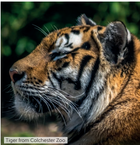
Tiger from Colchester Zoo

on the property ladder. Professionals commuting to Colchester, reachable in around 10 minutes by car, and further afield can take advantage of the excellent road and rail links as well. Residents will be ideally placed close to many amenities catering to everyday life, along with Colchester's shopping, dining and entertainment opportunities.