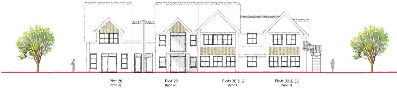
ZONE 4 - MOORS STREET ELEVATION