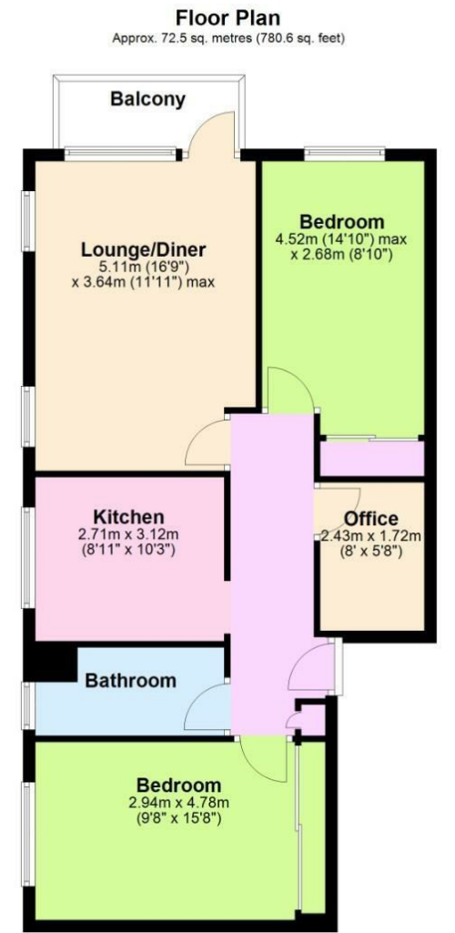
Total area: approx. 72.5 sq. metres (780.6 sq. feet)