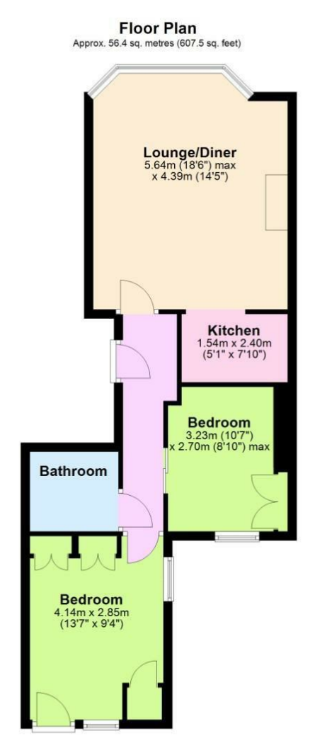
Total area: approx. 56.4 sq. metres (607.5 sq. feet)