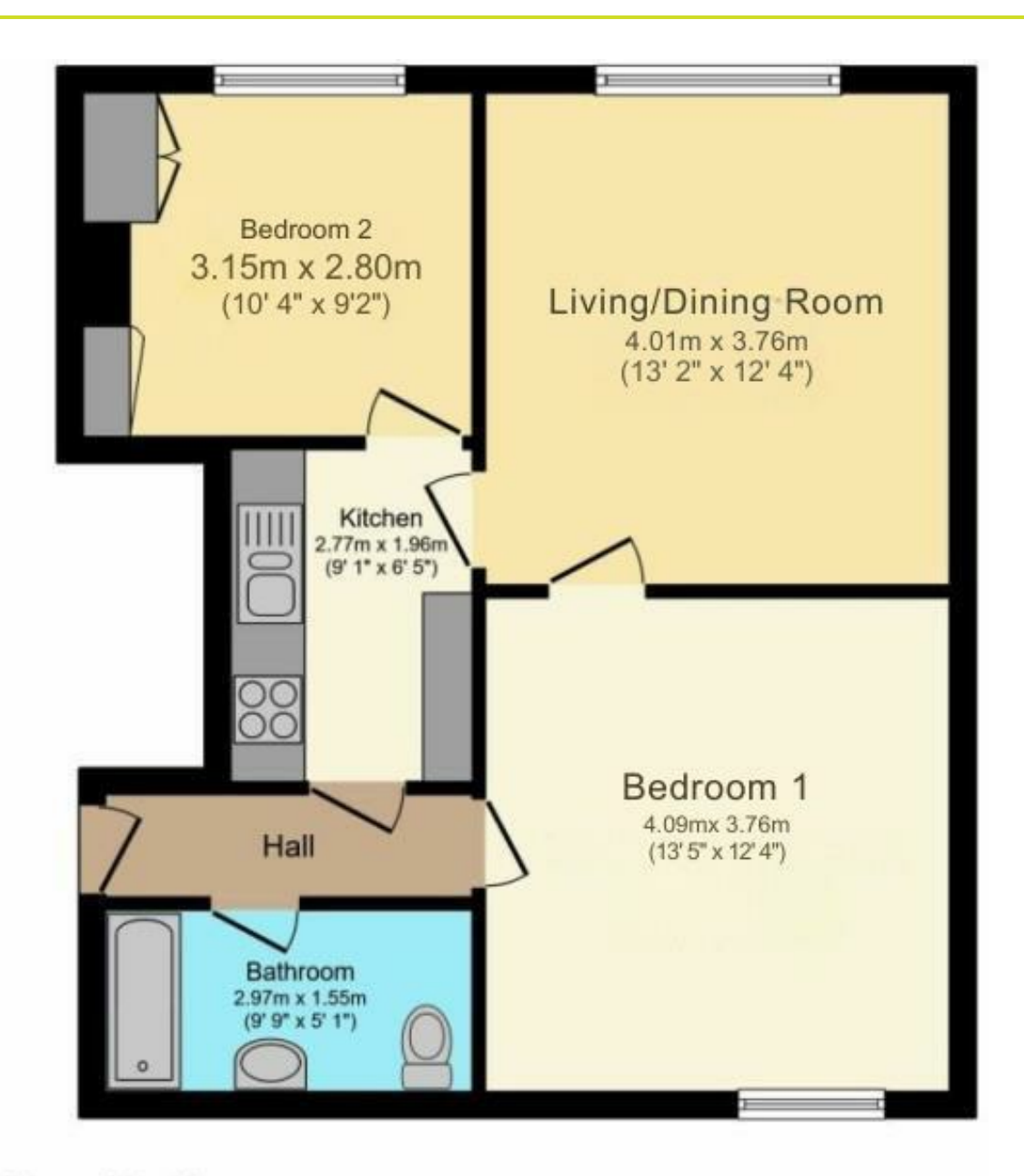
Total floor area 52.9 sq.m. (569 sq.ft.) approx