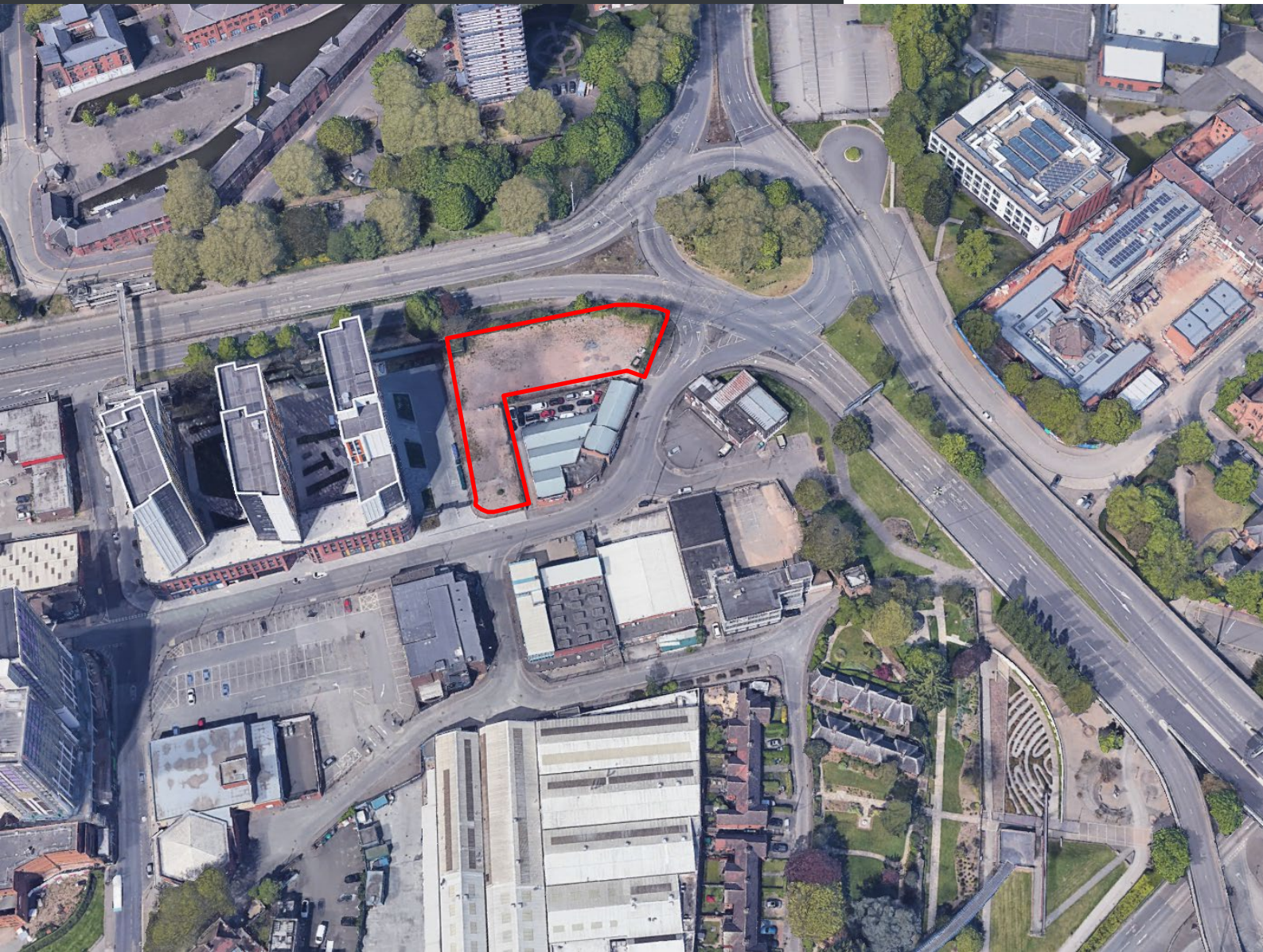
Site plan for indicative purposes only