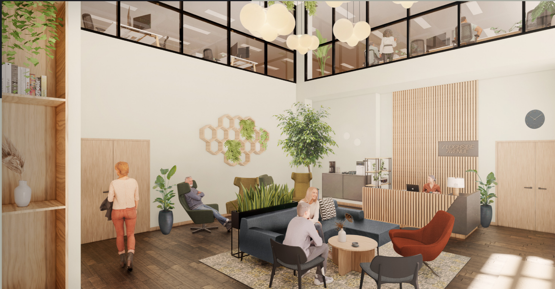
CGI of planned reception area

The atrium has been furnished to the highest quality, offering informal meeting or break out areas in an inviting, relaxing setting.