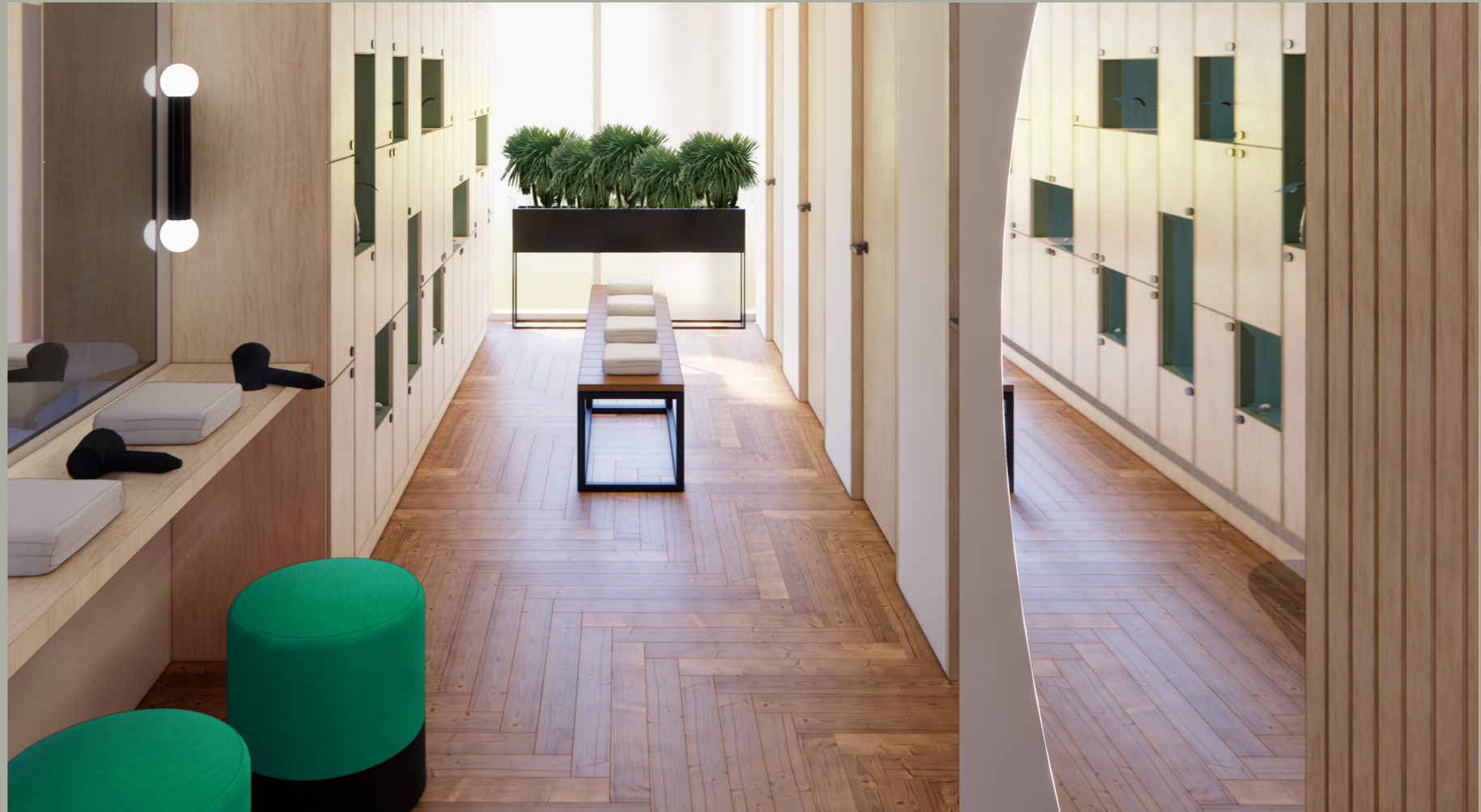
CGI of planned locker room

The building also benefits from outstanding public transport links with a tram stop on the doorstep, three train stations within walking distance and numerous bus routes close-by.