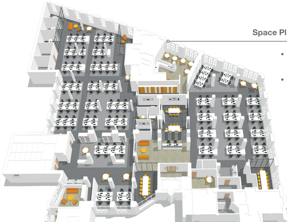
Floor 2 Space Plan 1:8 sq m