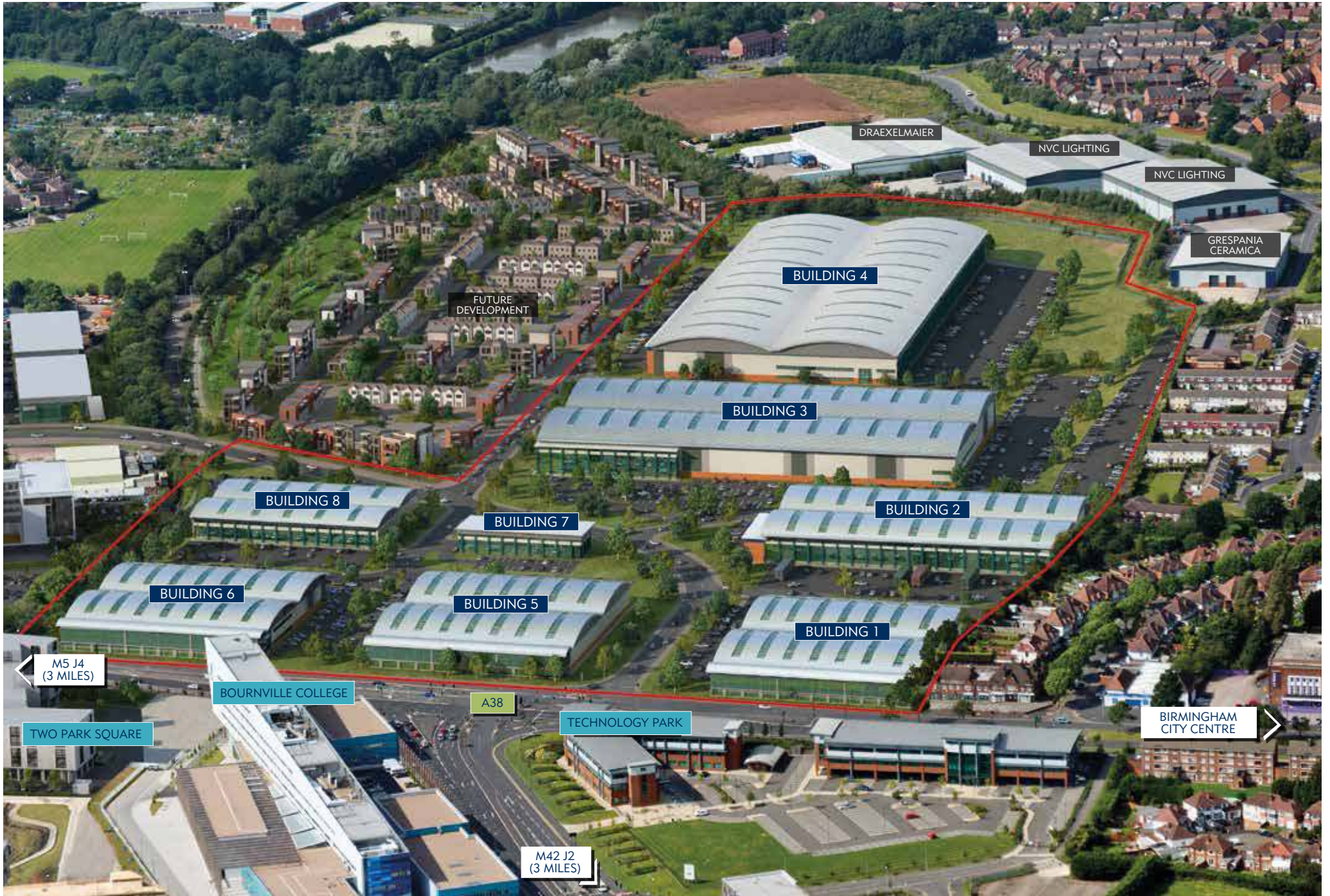
CGI of development opportunities at Longbridge Business Park