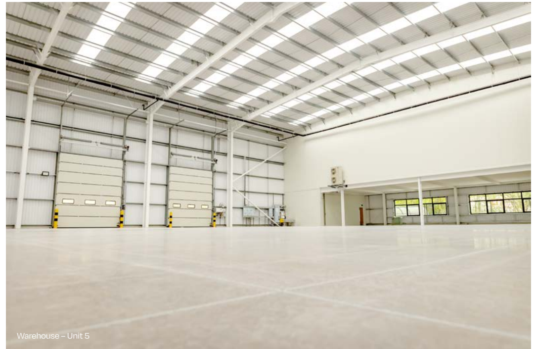
Warehouse - Unit 5