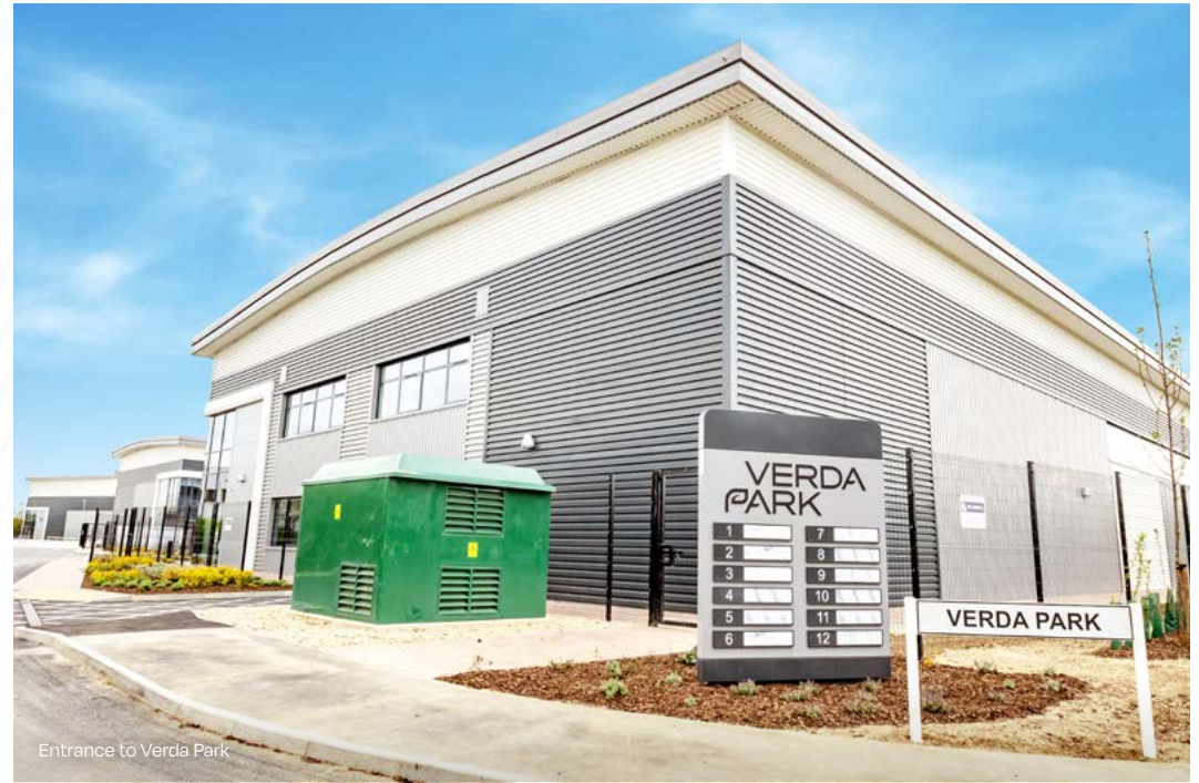
Entrance to Verda Park