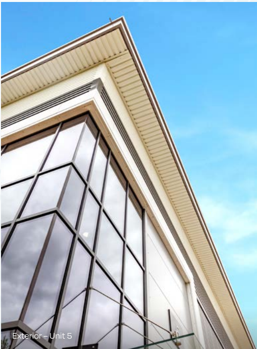
Exterior - Unit 5