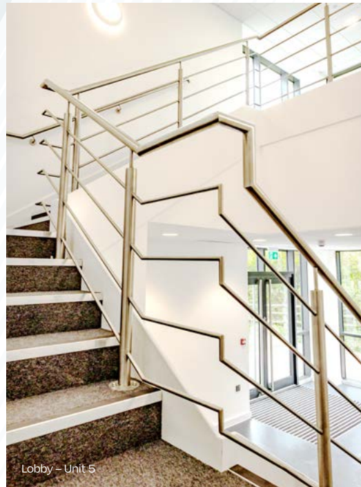
Lobby - Unit 5