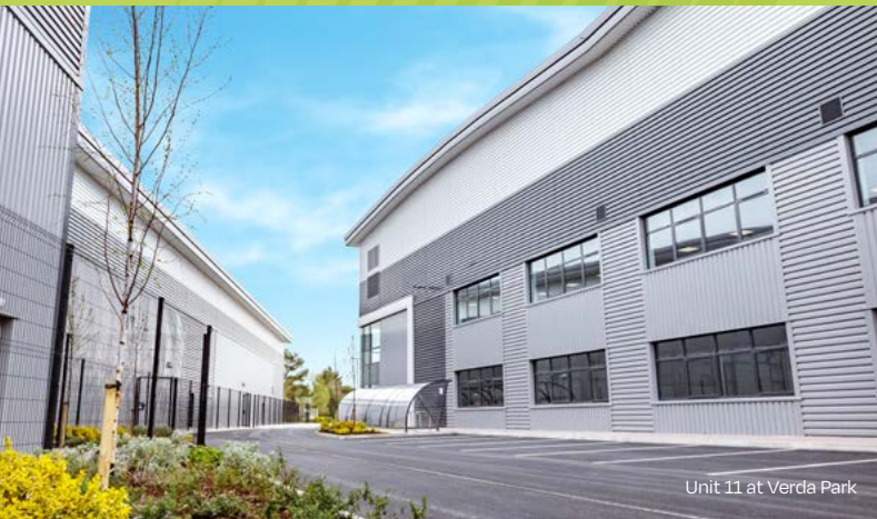
Unit 11 at Verda Park