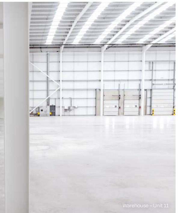
Warehouse - Unit 11