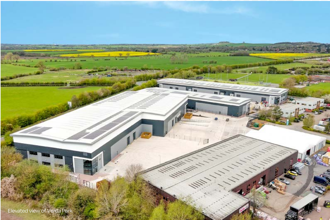
Elevated view of Verda Park