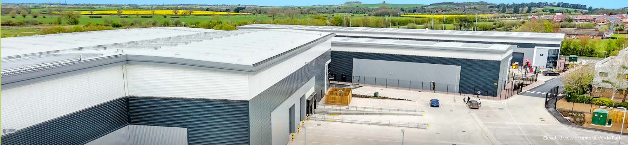
Elevated view of units at Verda-Park

Healthy office specification incorporating low of free VOCs in paints and materials