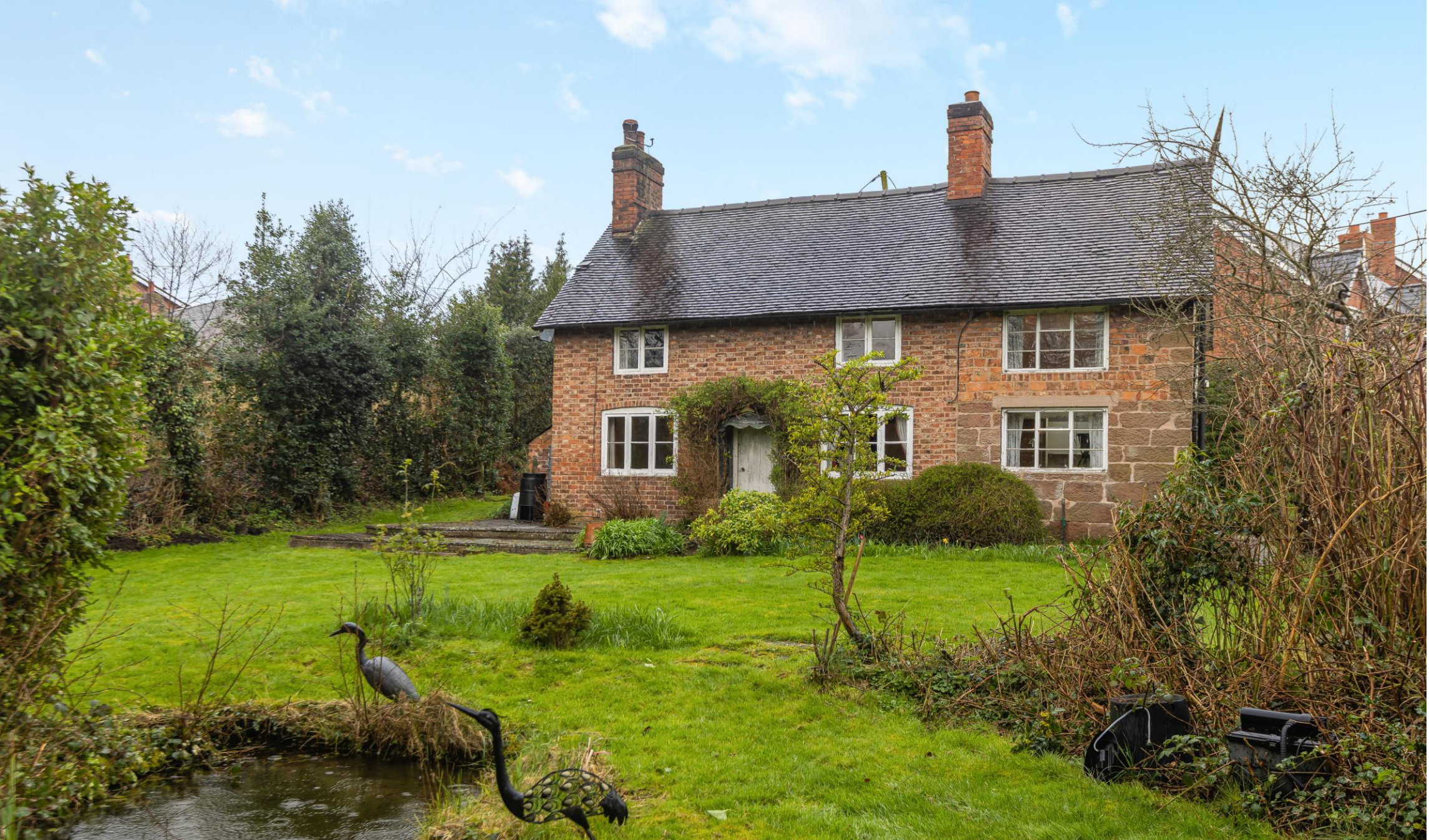
Brook Cottage Sadlers Wells, School Lane, Bunbury, CW6 9NU