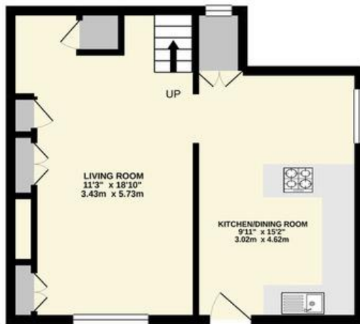
GROUND FLOOR 372 sq.ft. (34.6 sq.m.) approx.