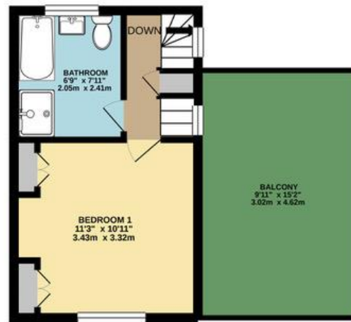
1ST FLOOR 212 sq.ft. (19.7 sq.m.) approx.