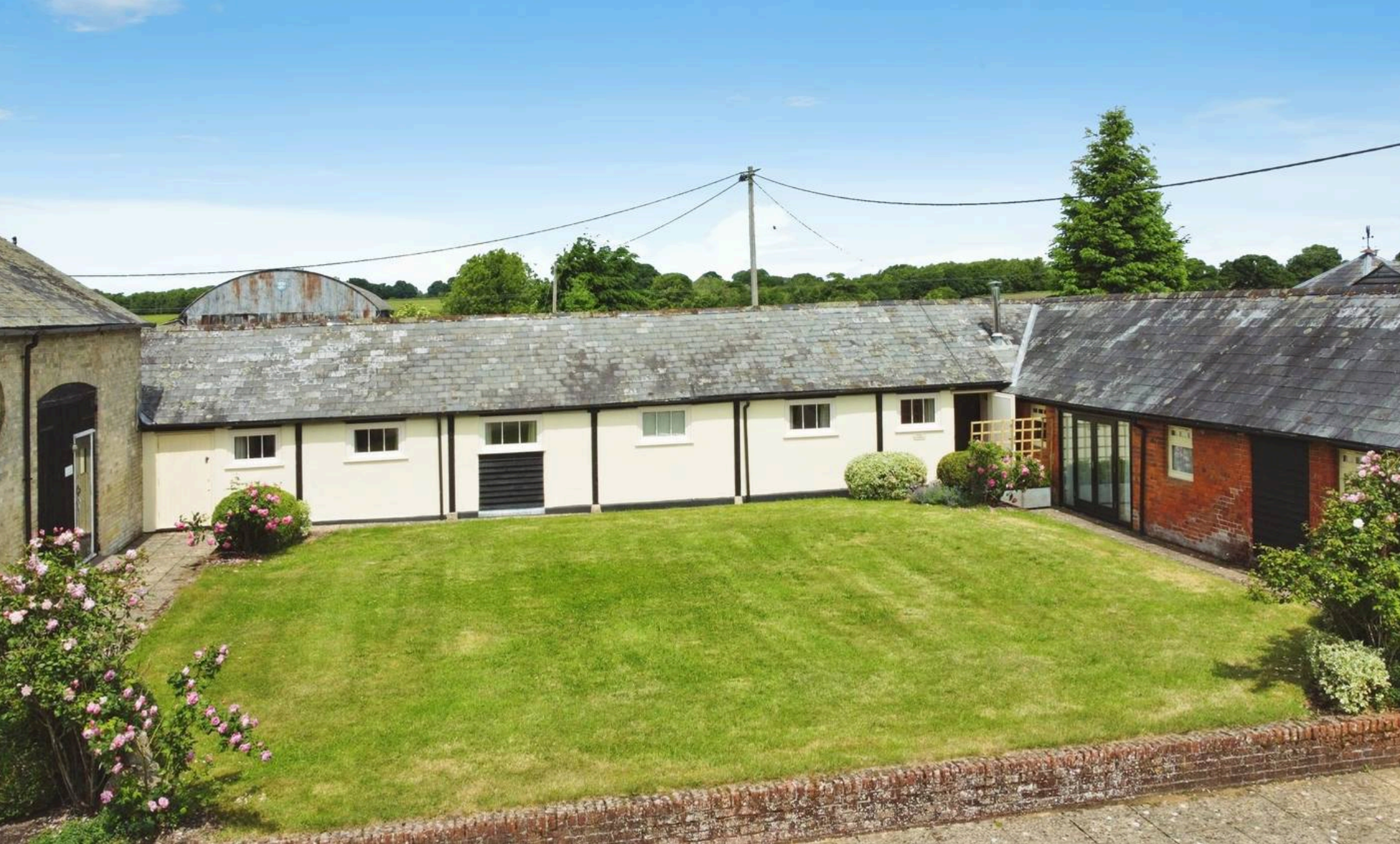
The Warren, Conygre Farm, Easton Royal £2,250 pcm