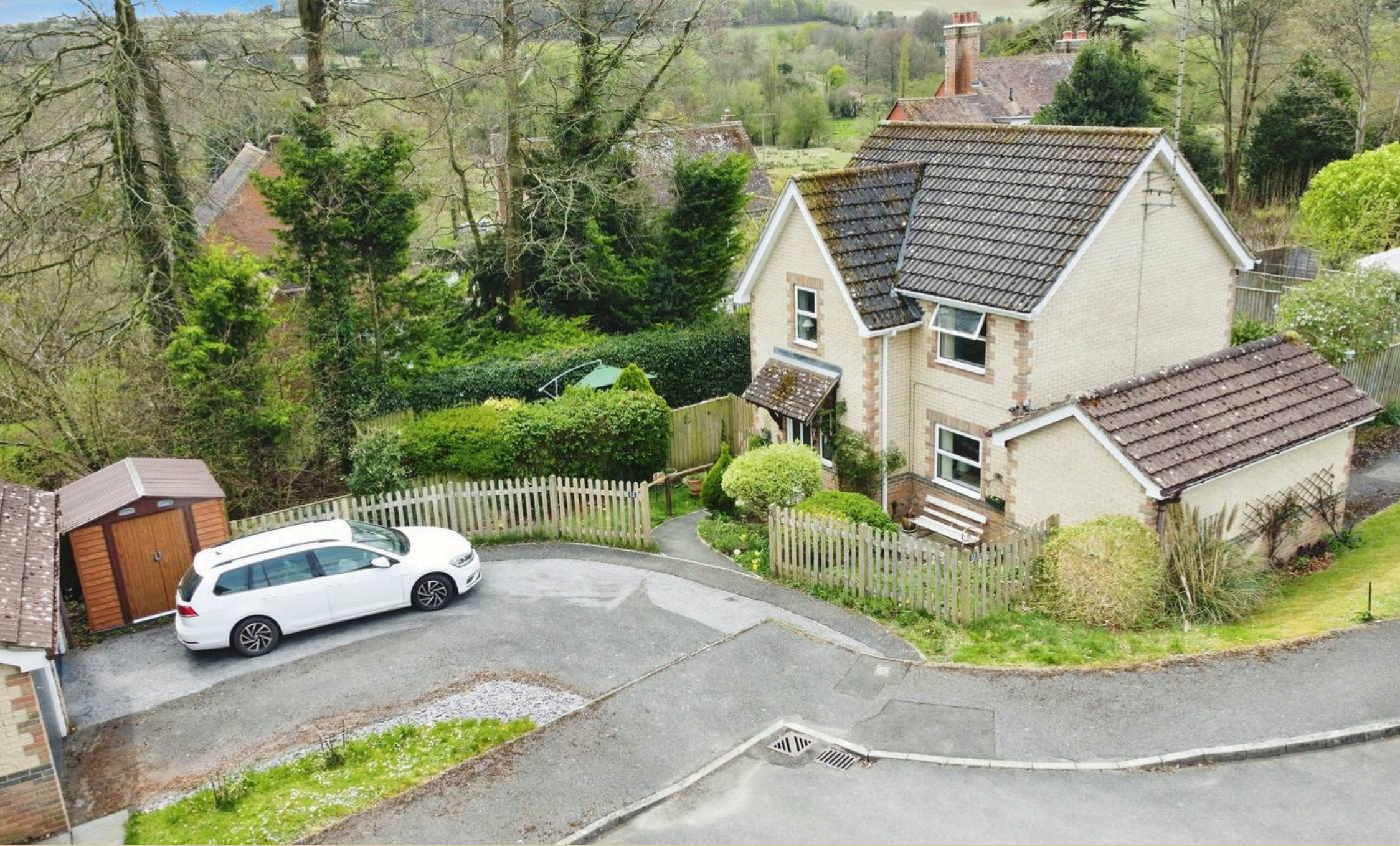
12 Hawkins Meadow, Marlborough £460,000