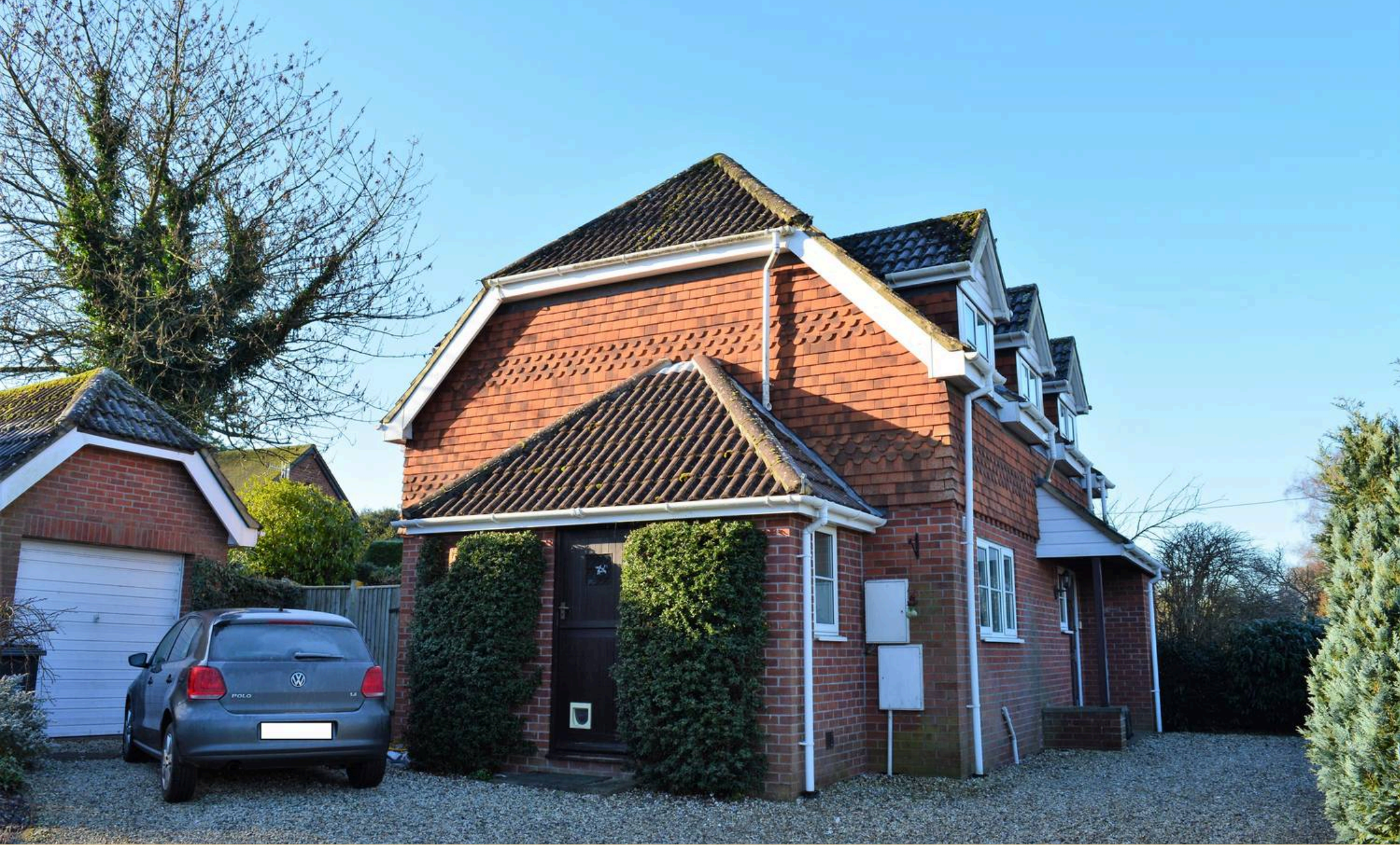
Orchard Cottage, High Street, Manton £1,800 pcm