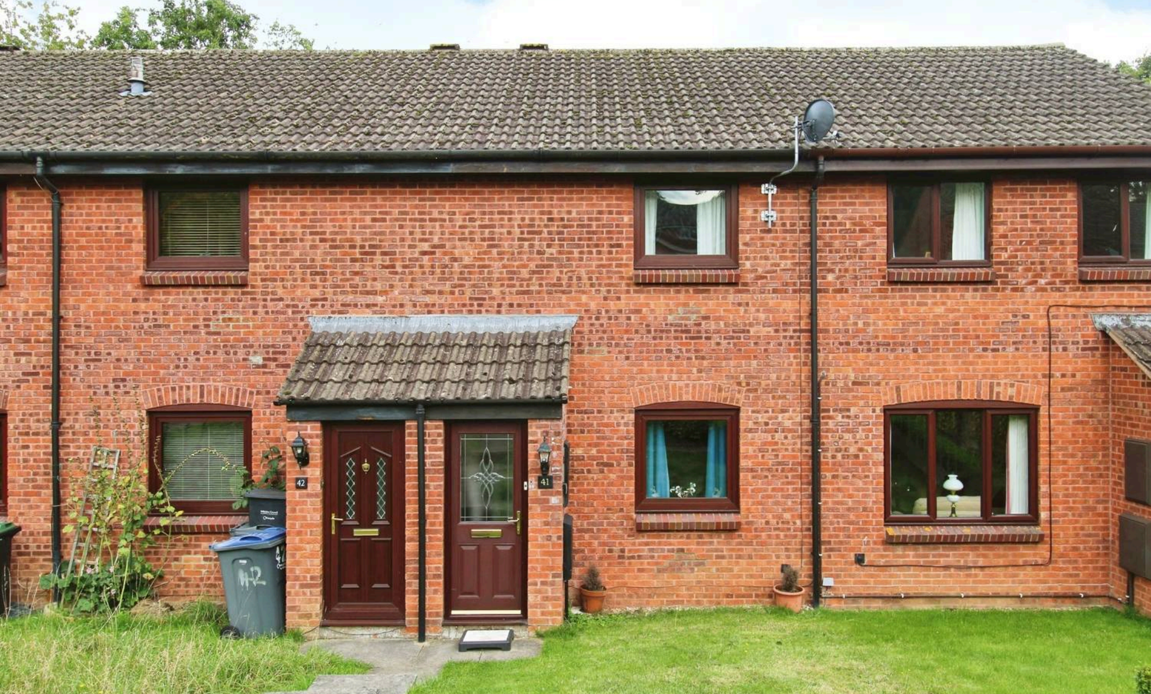
41 Rogers Meadow, Marlborough £259,000