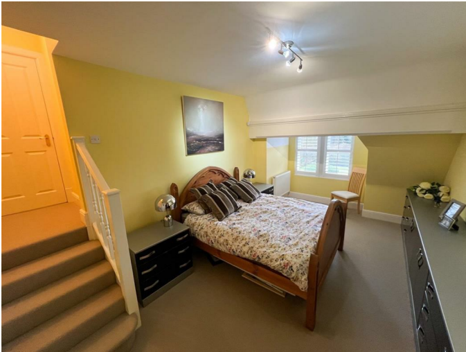
Bedroom Two 18'3" x 11'1" (5.58 x 3.38)

Located on the upper level bedroom two benefits from being another king sized room with garden views.