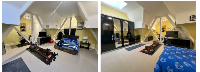
Bedroom Three 21'9" x 23'7" (6.65 x 7.20)

Possibly my favourite bedroom - bedroom three! With steps down into the room and super sized space on offer. Storage under eaves, high ceilings, sky light lighting, I am sure everyone moving in will be fighting over this cool bedroom space.