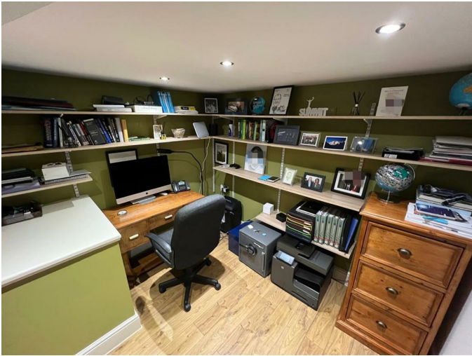
Study 9'2" x 9'0" (2.80 x 2.75)

Your own self contained work from home space! Or, maybe a games room for the kids? This space is super functional on a mid-level between level one and level two of this amazing property.