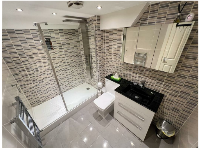
Bathroom 6'4" x 8'8" (1.95 x 2.65)

Main family bathroom - again super modern with white tiling, enclosed shower with tower shower unit, wall mounted mirror, toilet with button flush and wall mounted heated chrome towel rail.