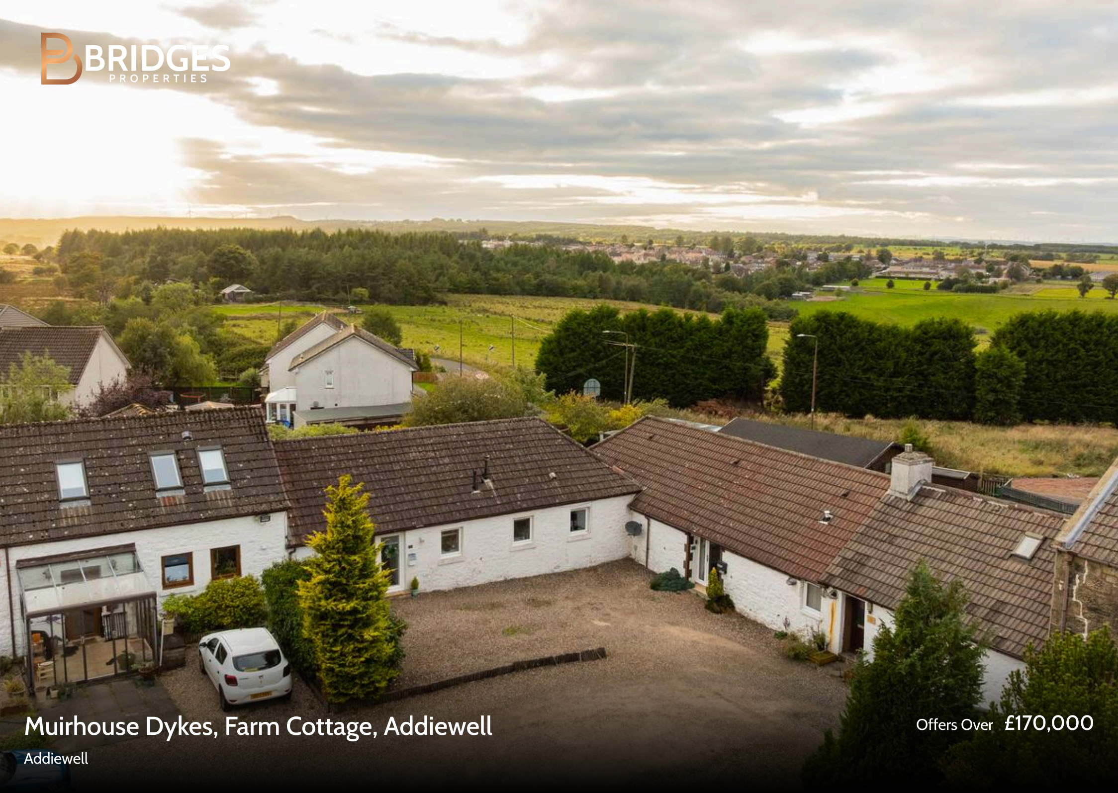
Muirhouse Dykes, Farm Cottage, Addiewell