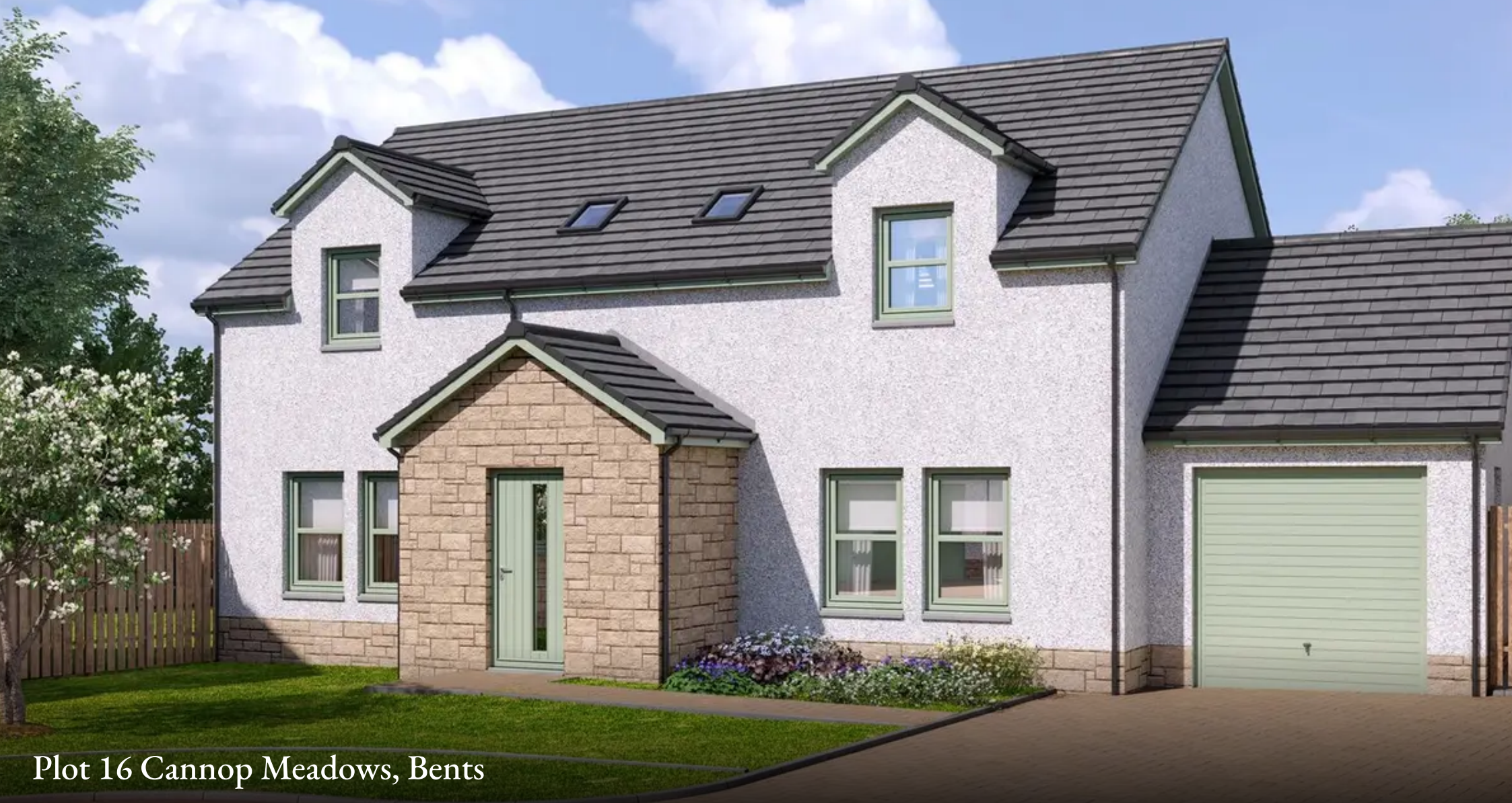
Plot 16 Cannop Meadows, Bents